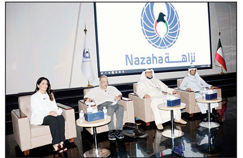
Officials from the 'Anti-Corruption Authority' during the training seminar.

She explained 11 observers from Arab countries will visit Kuwait, and Nazaha representatives will meet with them on Dec 3, noting that the procedures for their entry into the country have been adopted in cooperation with the Ministry of Justice with regard to hosting them in Kuwait and the quarantine and movement process and faci-