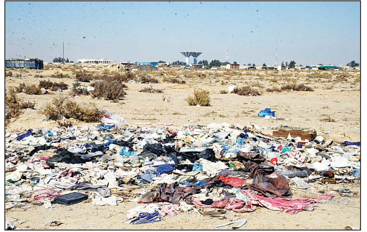
All kinds of garbage strewn on both sides of the road to Wafra, south Kuwait. Municipality department seems to have neglected the area for quite some time.

The bank clarified that it took this decision due to the exceptional circumstances the country is going through, particularly the repercussions of the novel coronavirus which continues to negatively affect the owners of SMEs. This is also part of the bank's commitment to fully support the SMEs under its funding.