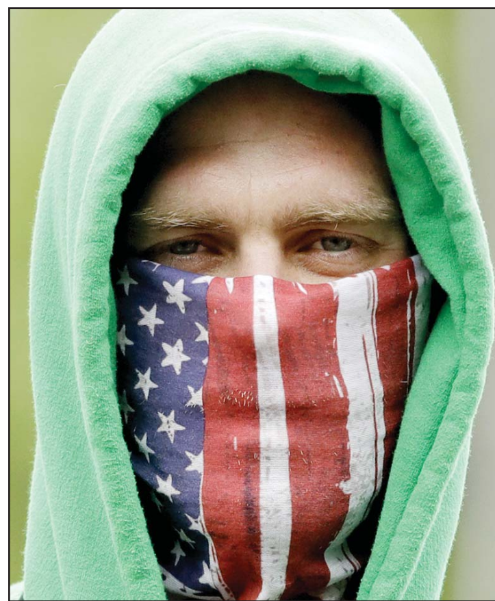
In this May 4, 2020 file photo, a man wears a mask as he waits in line outside the Warrensburg License Office in Warrensburg, Mo.