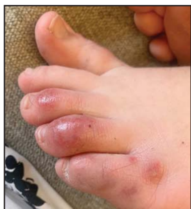
This April 6, 2020 photo shows discoloration on a teenage patient's toes three days after the onset of the condition informally called 'COVID toes'. The red, sore and sometimes itchy swellings on toes look like chilblains, something doctors normally see on the feet and hands of people who've spent a long time outdoors in the cold.