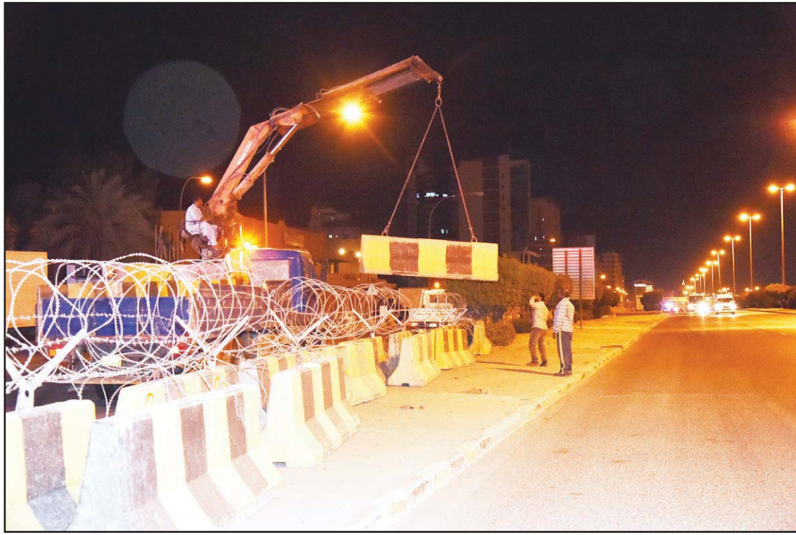
Road dividers and barbed wires being removed in Hawalli on the last day of the lifting of the total lockdown.