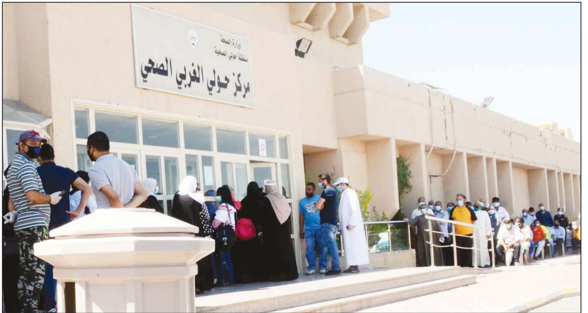
Huge rush seen as patients wait outside in the hot sun to get medicines at the Hawalli polyclinic.

The Kuwaiti Ministry of Health declared, earlier Monday, that 530 people contaminated with the germ recovered, during the past 24 hours, putting the whole count of those who recuperated at 31,770.