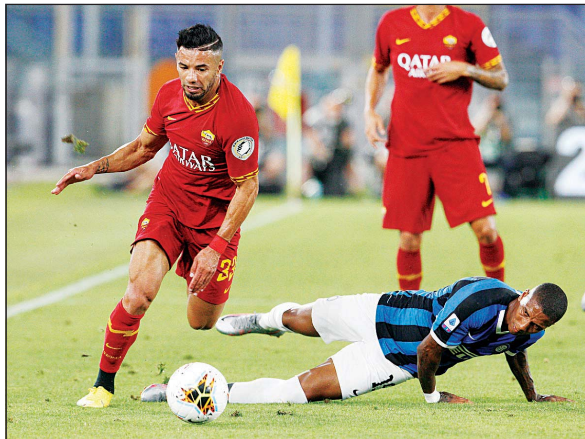
Roma's Bruno Peres (left), and Inter Milan's Ashley Young challenge for the ball during the Serie A soccer match between Roma and Inter Milan at the Rome Olympic Stadium on July 19.

Sampdoria came back from two goals down to win 3-2 at Parma, and Torino lost 2-0 at Fiorentina.