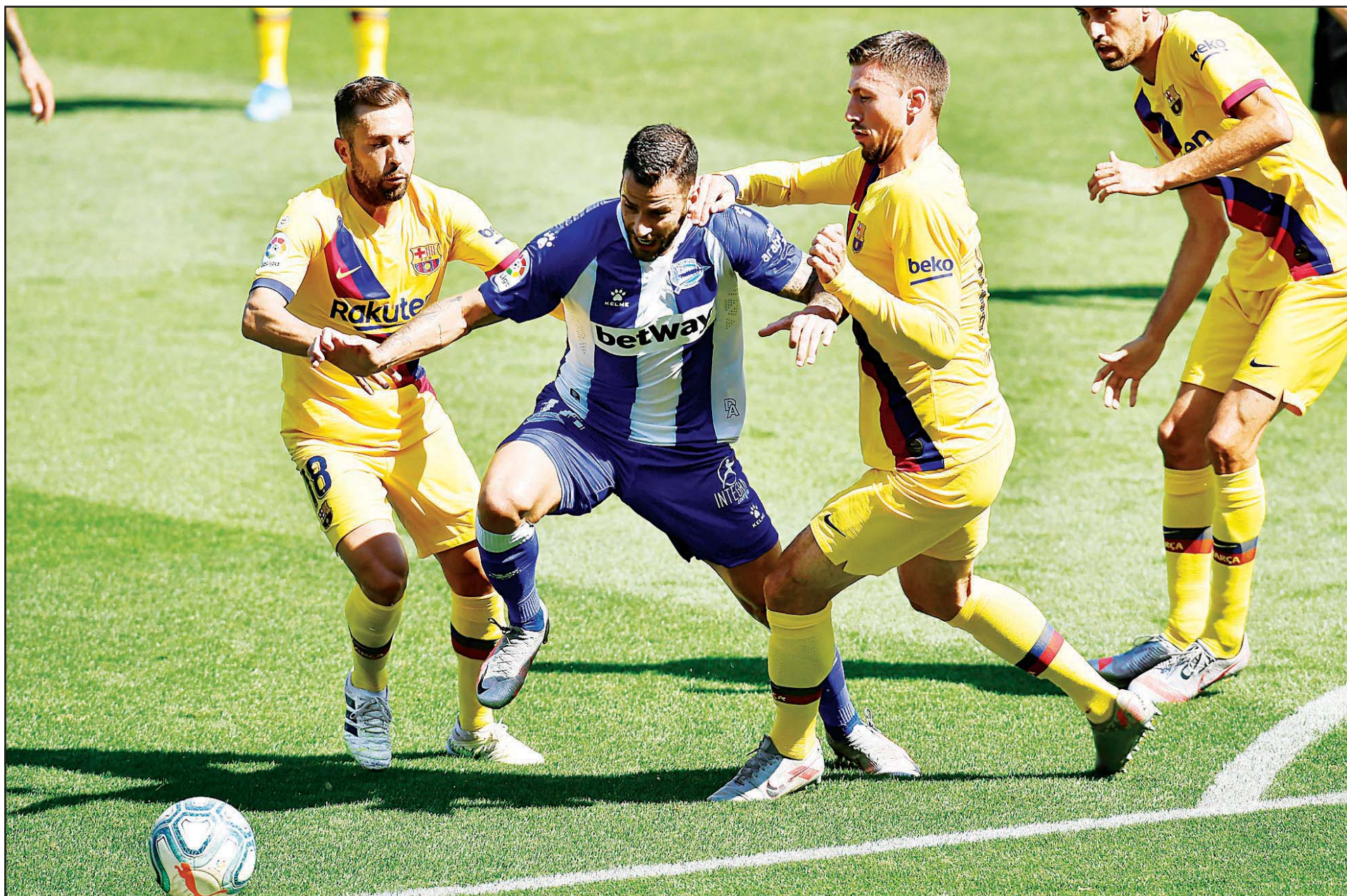
Alavés' Edgar Mendez, center, fights for the ball with Barcelona's Jordi Alba, left, and Clement Lenglet during the Spanish La Liga soccer match between Alavés and FC Barcelona, at Mendizorrosa stadium, in Vitoria, northern Spain, Sunday, July 19, 2020.