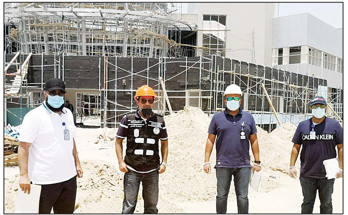
The team of inspectors at the site.

He stressed that it contradicts the idea of dedicating national unity in society and destroys the foundations