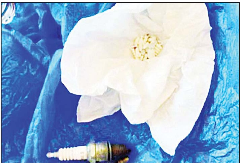
Goods seized from the Ethiopians.

The sources added, HH the Prime Minister and President of the Supreme Petroleum Council, Sheikh Sabah Al-Khaled, whom is known for his integrity, "clean hands" and his seriousness in combating corruption to hold those accountable for wrongdoing irrespective of the person's position.