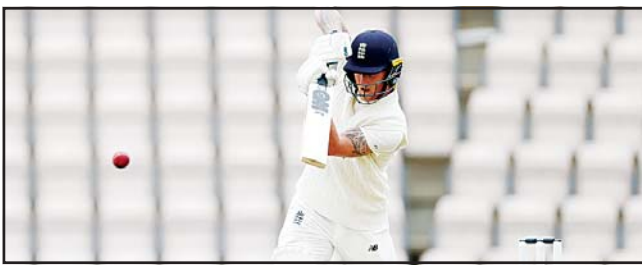
England captain Ben Stokes bats during the second day of the first cricket Test match between England and West Indies, at the Ageas Bowl in Southampton, England on July 9.