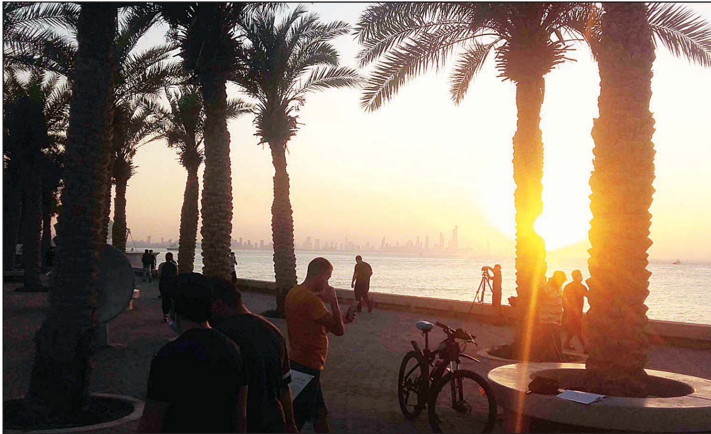
A view at the Salmiya beach as the sun goes down in the horizon.

The Kuwaiti delegation at the meeting included the Assistant Foreign Minister for Asian Affairs Ali Al-Saeed, the Assistant Foreign Minister for the Arab World Affairs Ambassador Fahad Al-Awadhi, the Assistant Foreign Minister for the Minister's Bureau Affairs Ambassador Saleh Al-Loughani, the State of Kuwait Permanent Envoy at the Arab League Ahmad Al-Bakr and other senior officials of the Kuwaiti Ministry of Foreign Affairs.