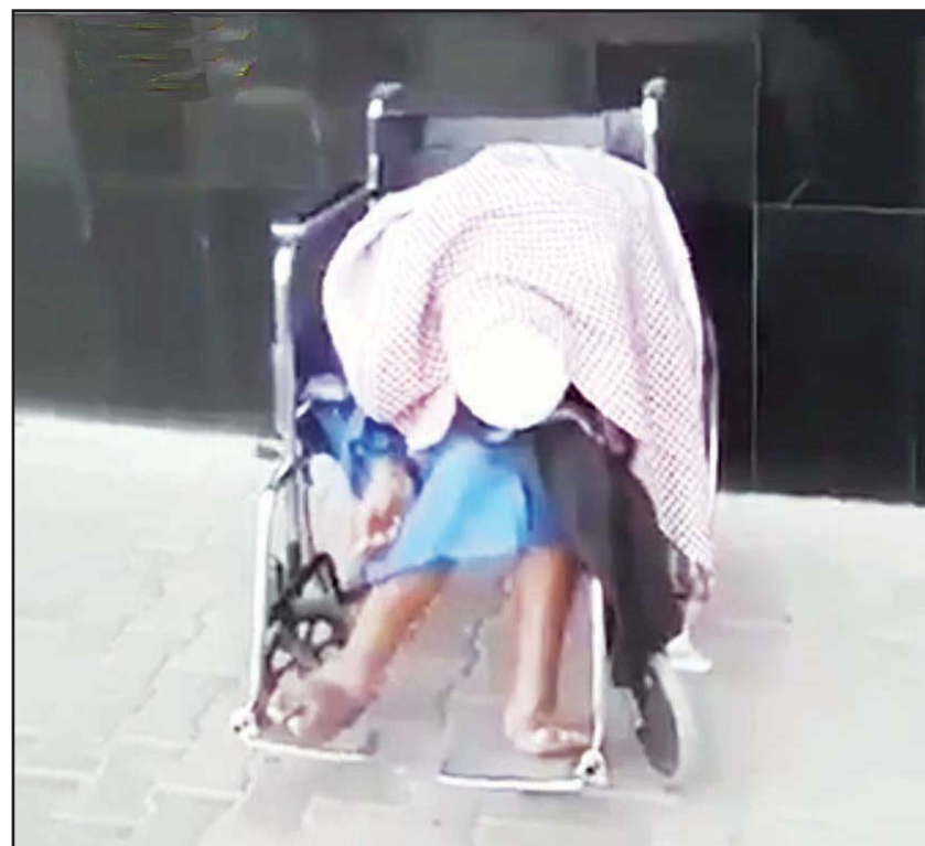
The body of a man slumped in a wheelchair.