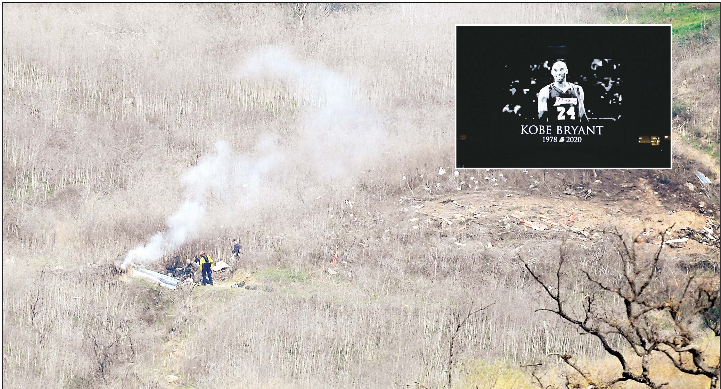
Firefighters and sheriffs work the scene of a helicopter crash that killed former NBA basketball player Kobe Bryant on Jan 26 in Calabasas, Calif. Bryant, his 13-year-old daughter and several others were killed in the helicopter crash on a steep hillside in dense morning fog in Southern California on Sunday. (Inset) A tribute to Kobe Bryant was shown on the screen before the start of an NBA basketball game between the Orlando Magic and the Los Angeles Clippers in Orlando, Fla.

HH the Amir condolences US Pres. on helicopter crash victims