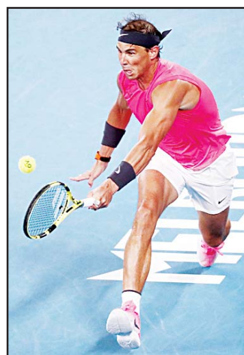
Spain's Rafael Nadal makes a forehand return to Australia's Nick Kyrgios during their fourth round singles match at the Australian Open tennis championship in Melbourne, Australia, Jan 27.

On Wednesday, the 33-year-old Nadal's 41st career Grand Slam quarter-final will be against No. 5 Dominic Thiem in a rematch of the past two French Open finals, both won by Na-