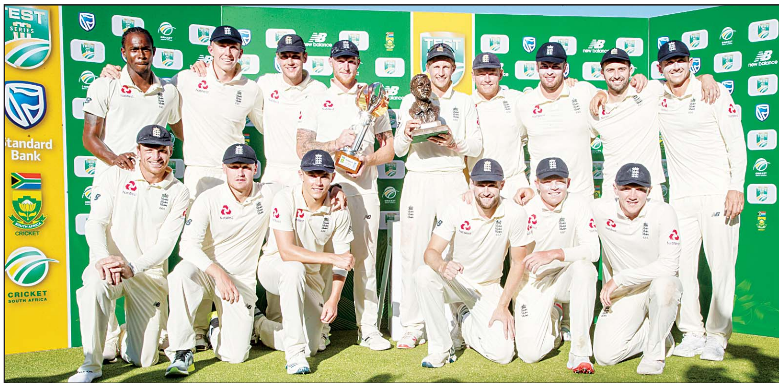
England players pose for photographers after receiving their trophy at the end of day four of the fourth cricket Test match between South Africa and England at the Wanderers Stadium in Johannesburg, South Africa on Jan 27.