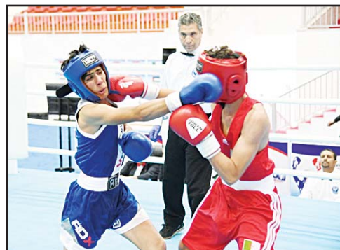
Photos taken from the First Arab Juniors Boxing Championship.