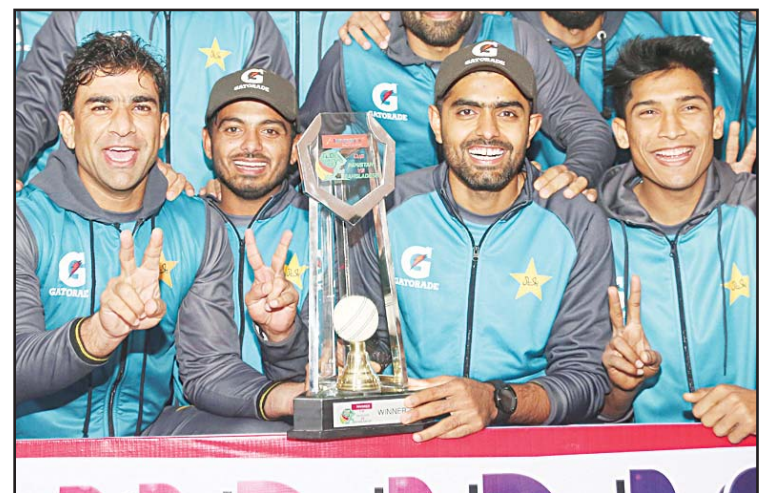
Pakistan cricket players celebrate their victory against Bangladesh at Gaddafi Stadium in Lahore, Pakistan on Jan 27.

Late last year, Sri Lanka also split its tour to Pakistan into two phases when it played a T20 series in Lahore then returned in December for two Test matches in Rawalpindi and Karachi, staying in Pakistan for 16 days.