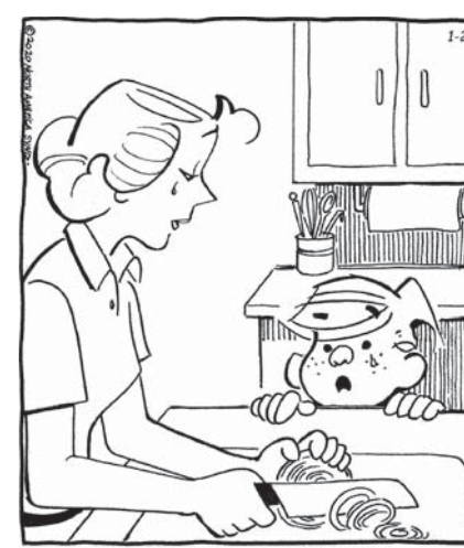
"IF ONIONS MAKE YOU CRY, WHY AREN'T THEY CALLED BULLIES?"

٨٣٨٣ Thamaniyat alaaaf wa thalath maah wa thalath wa thamanoon