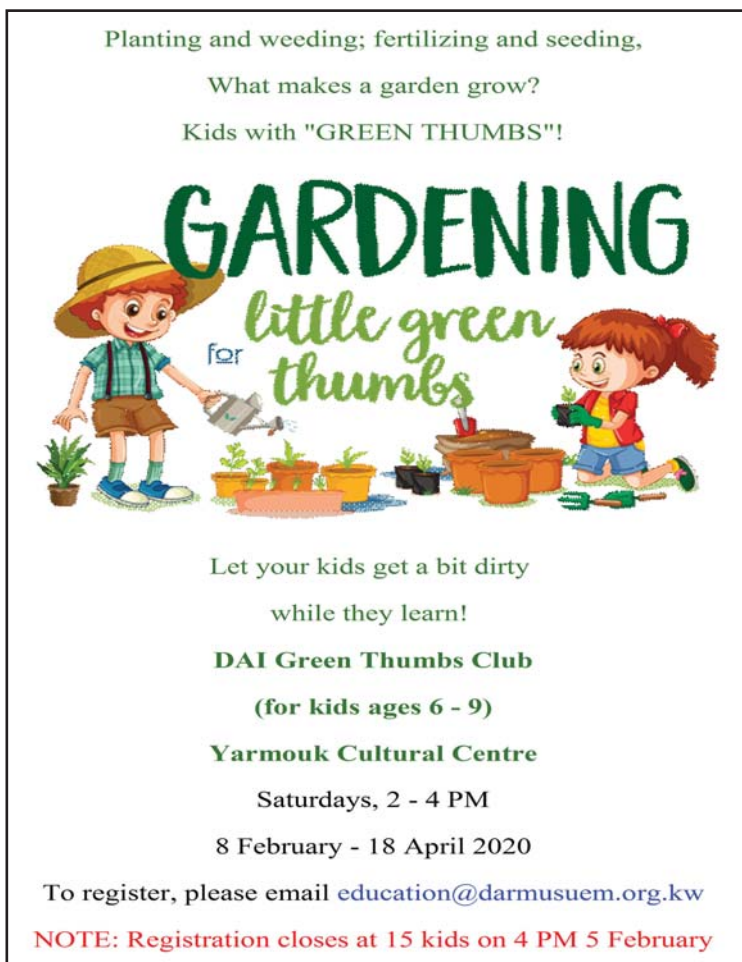
A flyer of the event