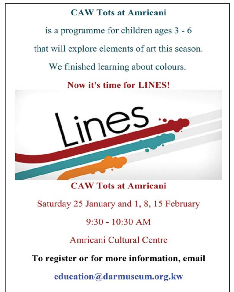
A flyer of the event