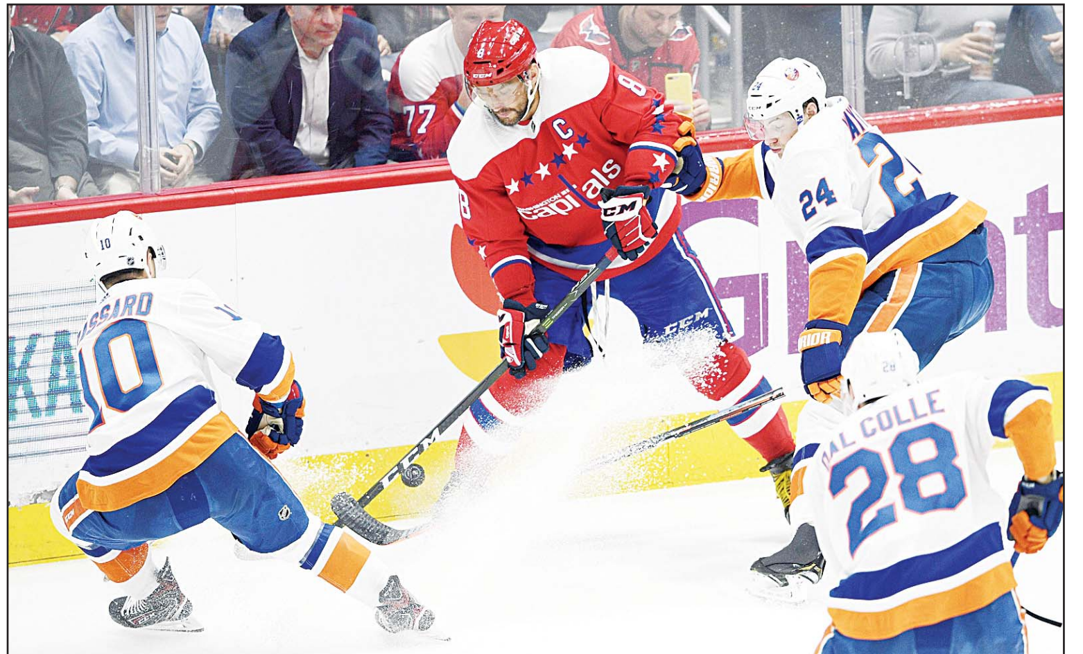
Washington Capitals left wing Alex Ovechkin (8), of Russia, and New York Islanders defenseman Scott Mayfield (24), left wing Michael Dal Colle (28) and Derick Brassard battle for the puck during the second period of an NHL hockey game on Feb 10 in Washington.