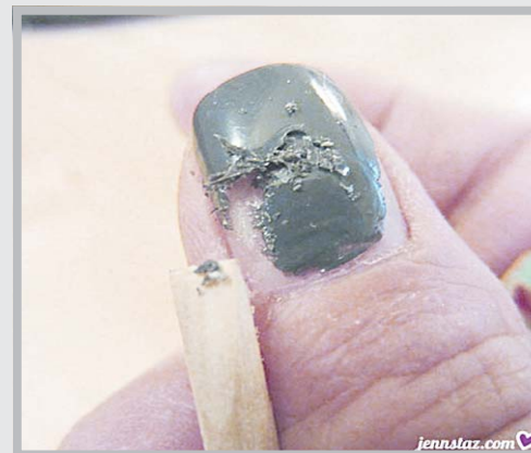
do not scrap off nail polish

Who hasn't, at some time or another, scratched the nail polish off their fingernails? Don't be tempted again! It is a destructive habit and damaging to your nails. When scraping away you are unwittingly removing the top layer of your nail, which in turn weakens the nail bed. You can end up with problems like ridges and split nails that break easily.