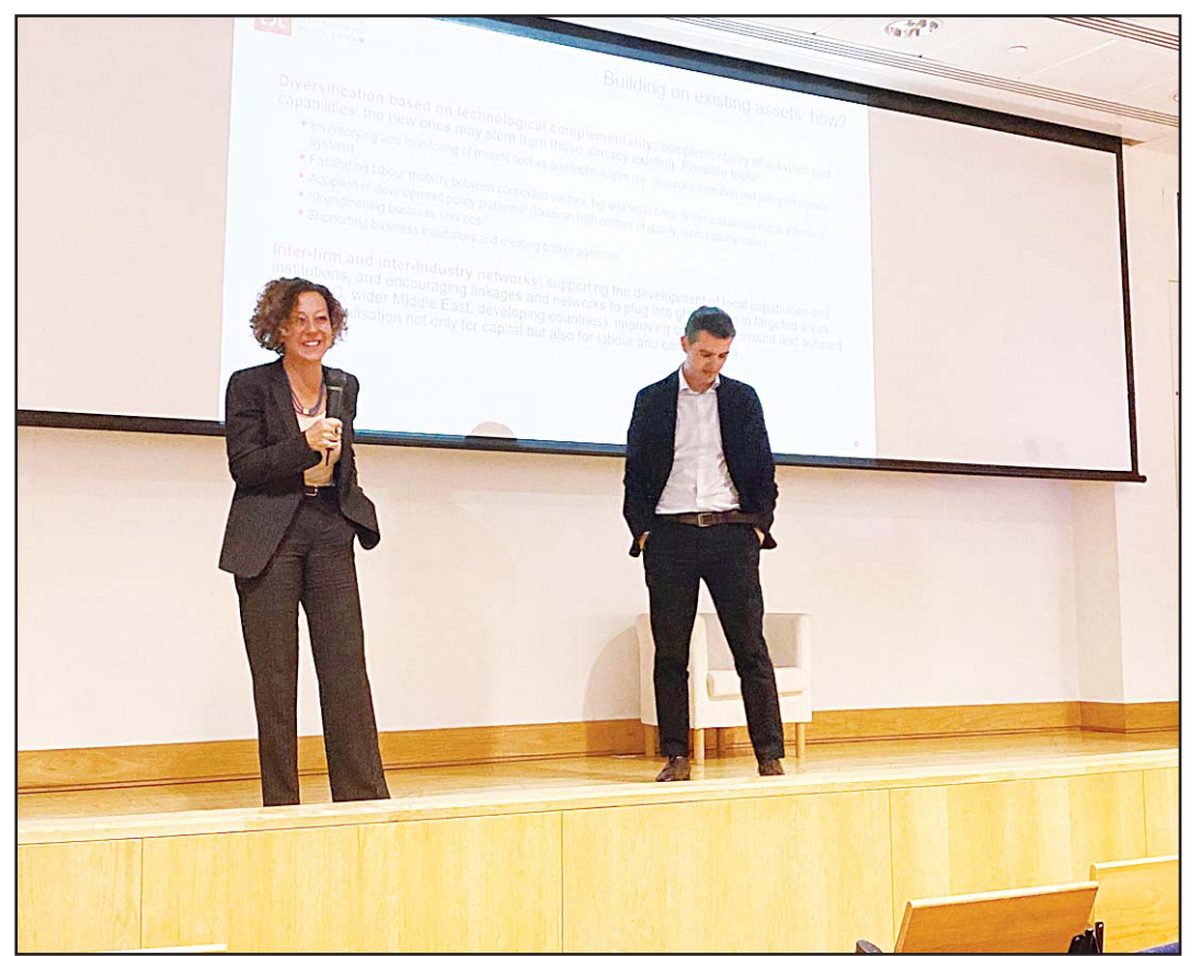
Photo from the event