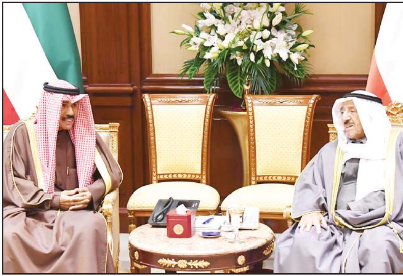
Left: His Highness the Amir Sheikh Sabah Al-Ahmad Al-Jaber Al-Sabah received Tuesday at Bayan Palace His Highness the Crown Prince Sheikh Nawaf Al-Ahmad Al-Jaber Al-Sabah and (right) with Speaker Marzouq Al-Ghanim and Iraqi Parliament Speaker Mohammad Al-Halbousi