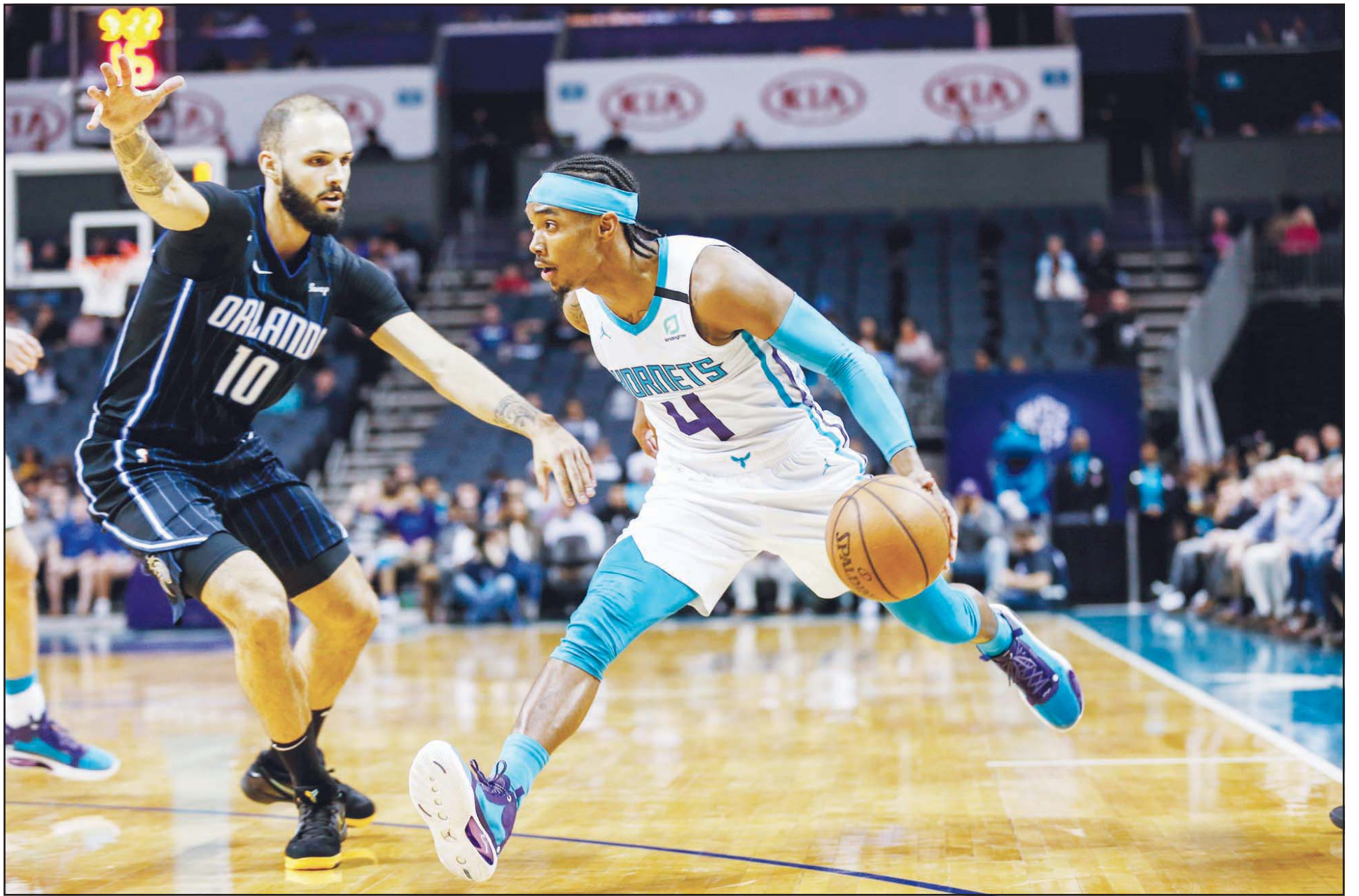
Charlotte Hornets guard Devonte' Graham (right), drives around Orlando Magic guard Evan Fournier during the first half of an NBA basketball game in Charlotte, NC, Feb 3.