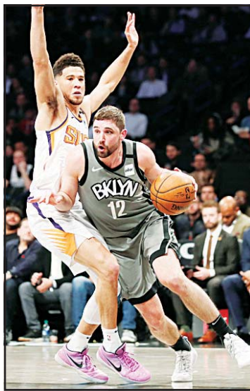
Brooklyn Nets forward Joe Harris (12) drives around Phoenix Suns guard Devin Booker (1) during the first quarter of an NBA basketball game, Feb 3, in New York.

Porzingis shot 6 of 13 on 3-pointers and made all 12 of his free throws. Tim Hardaway Jr. contributed 25 points for the Mavericks, who played without injured All-Star starter Luka Doncic (sprained ankle) for the third