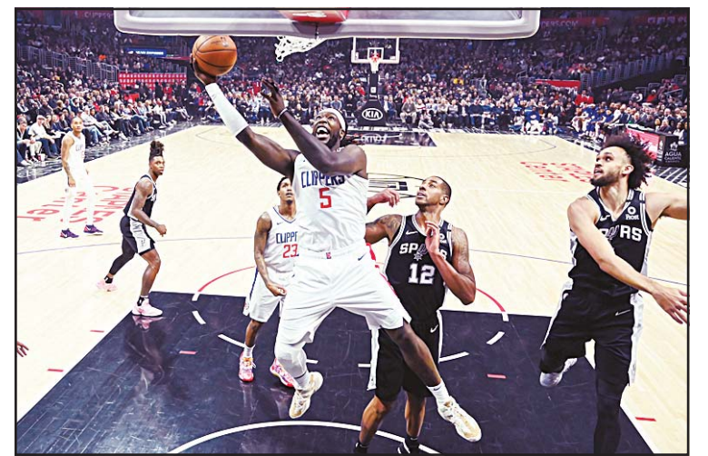
Los Angeles Clippers' Montrezl Harrell (5) goes up for a layup against the San Antonio Spurs during the first half of an NBA basketball game on Feb 3, in Los Angeles.

Karl-Anthony Towns had 22 points, 10 rebounds and six assists to lead six Timberwolves players in double figures.