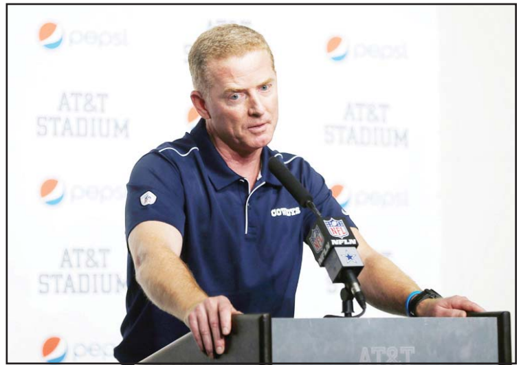
In this Dec 15, 2019, file photo, then-Dallas Cowboys head coach Jason Garrett takes part in a news conference following an NFL football game against the Washington Redskins in Arlington, Texas.