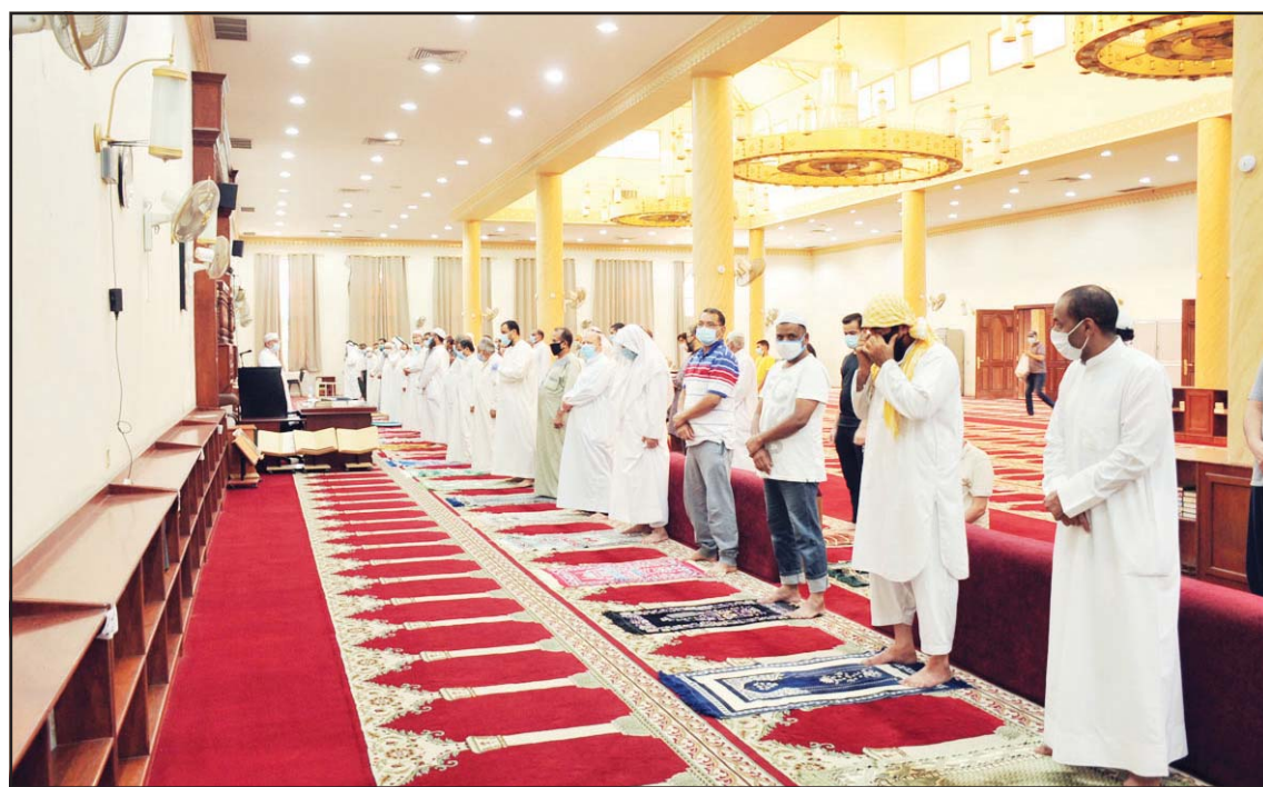
Worshippers observing the SOPs, maintaining social distance, wearing masks, bringing own prayer mat at one of the mosques during prayer in a Kuwaiti suburb.

The sources explained that there is a large percentage of projects, especially of the government, that are committed to the decision to ban work during the period between 11:00 am and 4:00 pm. However, many of such violations are committed by some subcontractors or construction workers working in private plots. The workers complain about the contractor's lack of commitment, but unfortunately most of their residences are not under the contractor who holds the contract.