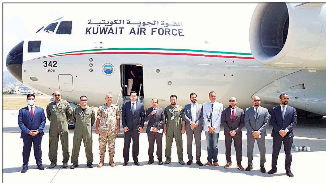
Kuwait Embassy staff and the representatives of the Lebanese Army receive aid sent by Kuwait to Lebanon after the disastrous blast in Beirut Port.

Sources said the Council of Ministers refused to renew the tenure of the aforementioned officials due to the passage of two full terms after their appointment; hence, they are not entitled for renewal but their work is still continuing under the wage-for-work system.