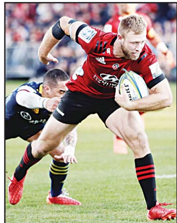
Crusaders' Braydon Ennor breaks the tackle of Highlanders' Aaron Smith to score his team's final try during the Super Rugby Aotearoa rugby game between the Crusaders and the Highlanders in Christchurch, New Zealand on Aug 9.

Plesac (1-1) allowed five hits and struck out seven in lowering his ERA to 1.29 this year.