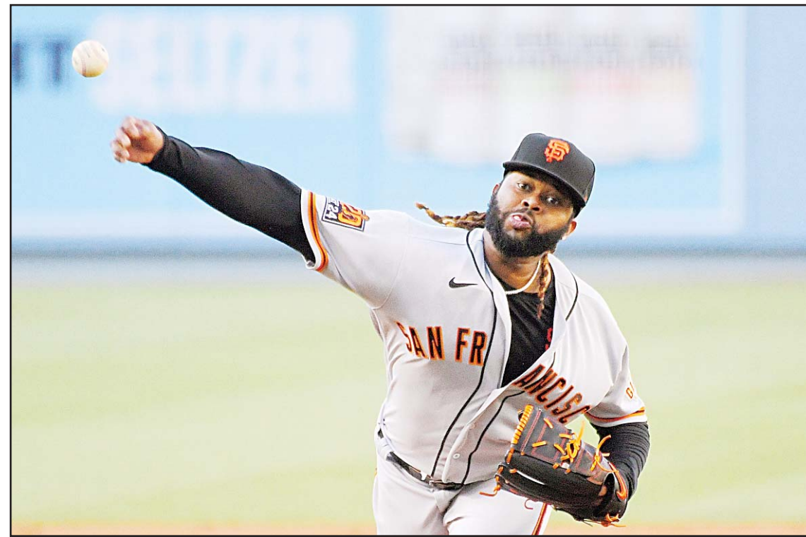
San Francisco Giants starting pitcher Johnny Cueto throws during the first inning of the team's baseball game against the Los Angeles Dodgers on Aug 8, in Los Angeles.

Matt Chapman homered in the eighth and added an RBI groundout in