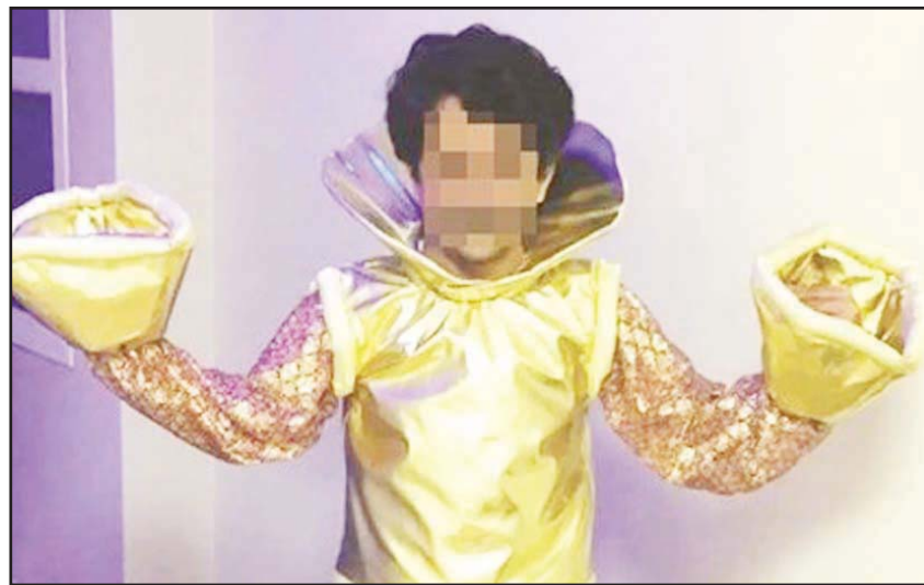
The Asian actor in a peculiar dress.

In her appeals she says she put her hope in God Almighty and in your honorable person to allow me to sponsor my husband because of his health condition and help us live a united family life. I am the sole bread winner, the appeal concluded.