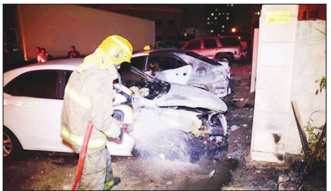
A fireman douses the fire.

Top official cleared: According to reliable sources from the Ministry of Communications, the investigation conducted by the committee, which was formed by the State Minister for National Assembly Affairs and State Minister for Services Affairs Mubarak Al-Harees last month,