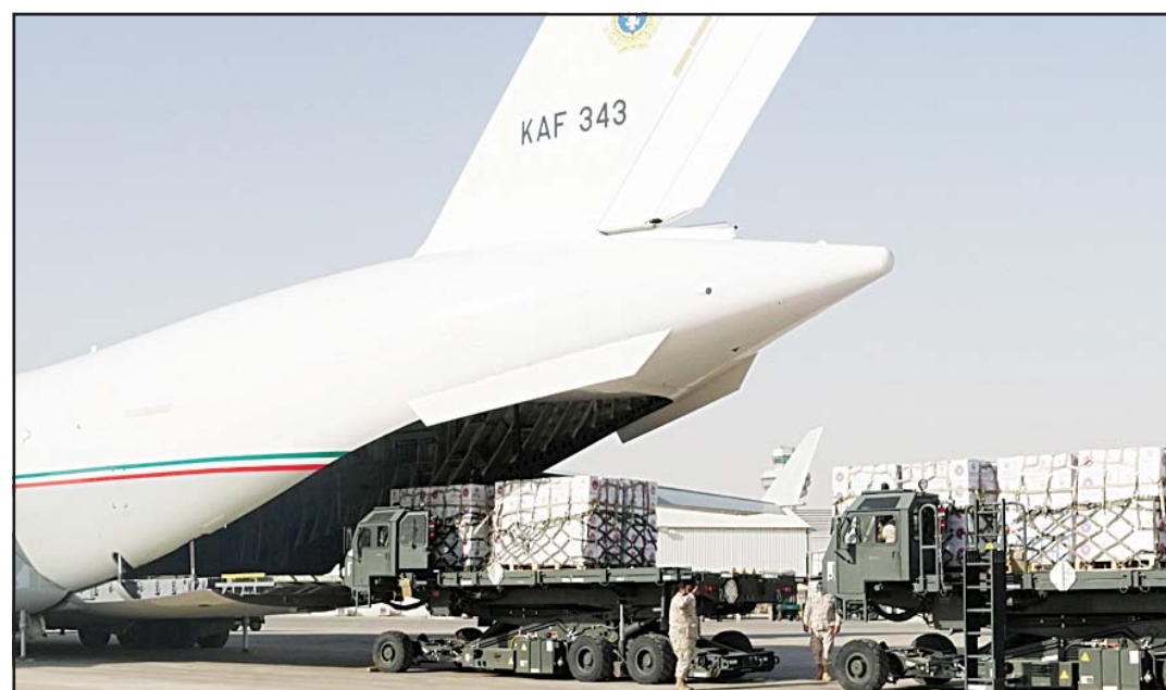
Kuwait's aircraft being loaded with the relief aid.