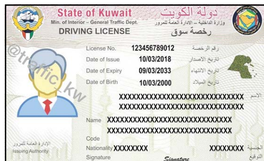
The new face of driving license .