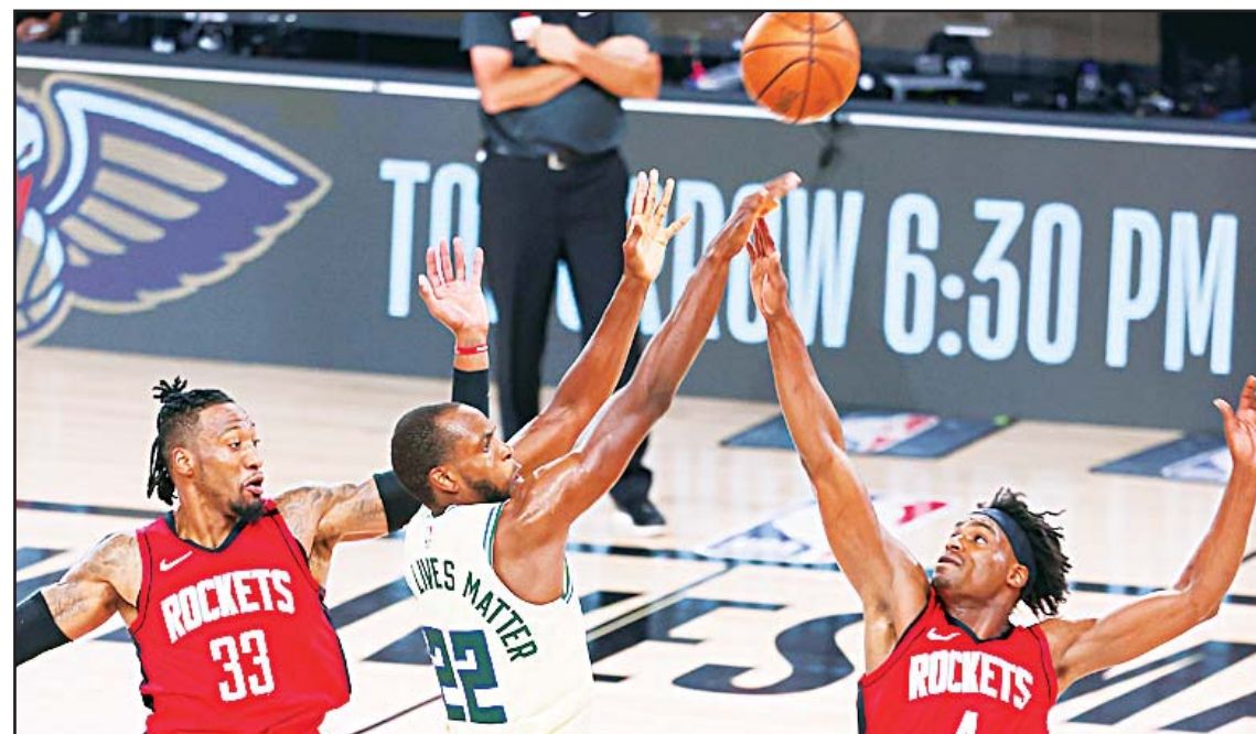
Milwaukee Bucks' Khris Middleton (22) tries for a 3-pointer against Houston Rockets' Robert Covington (left), and Danuel House Jr during an NBA basketball game on Aug 2, in Lake Buena Vista, Fla.

Thomas Bryant had a career-high 30 points and 13 rebounds, and Troy Brown Jr. added 22 points, 10 rebounds and eight assists for the Wizards.