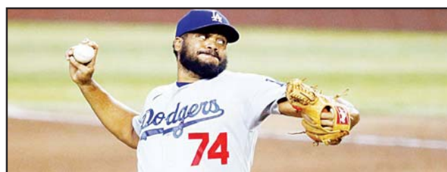
Los Angeles Dodgers relief pitcher Kenley Jansen throws a pitch against the Arizona Diamondbacks during the ninth inning of a baseball game on Aug 2, in Phoenix. The Dodgers defeated the Diamondbacks 3-0. - See Page 19