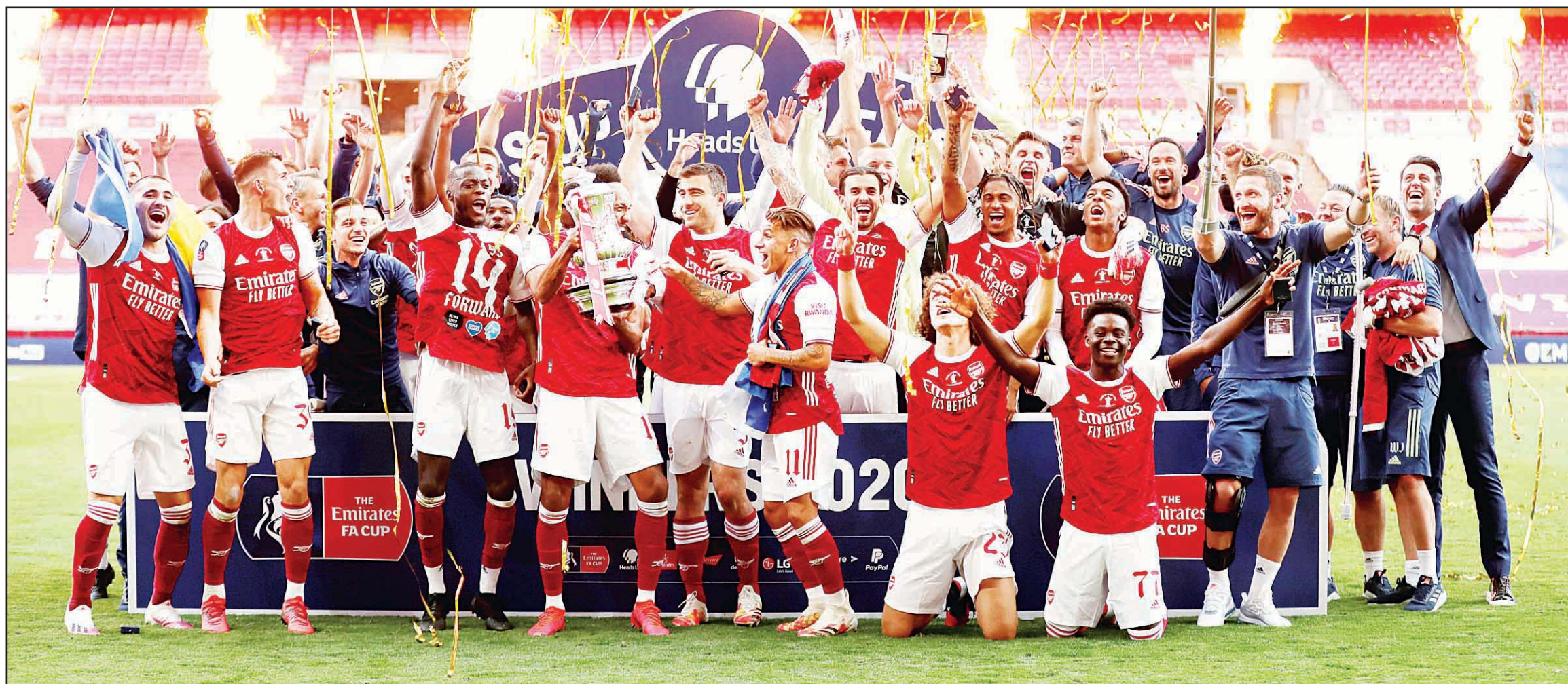
Pyrotechnics go off as Arsenal's players celebrate with the trophy after the FA Cup final soccer match between Arsenal and Chelsea at Wembley stadium in London, England on Aug 1. Arsenal beat Chelsea 2-1.

Latest sports scores at — http://sports.arabtimesonline.com