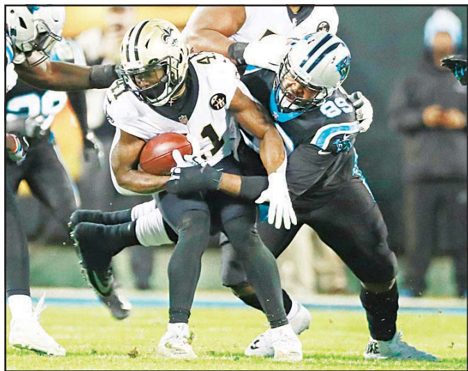
In this Dec 17, 2018 file photo, New Orleans Saints' Alvin Kamara (41) is tackled by Carolina Panthers' Kawann Short (99) in the first half of an NFL football game in Charlotte, N.C.