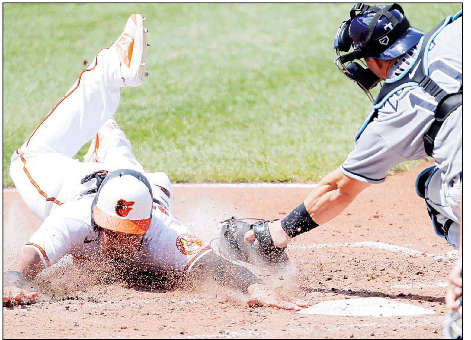
Tampa Bay Rays catcher Mike Zunino (right), applies a tag on Baltimore Orioles' Anthony Santander, who is attempting to score on a single by pinch-hitter Jose Iglesias during the fifth inning of a baseball game, on Aug 2, in Baltimore.