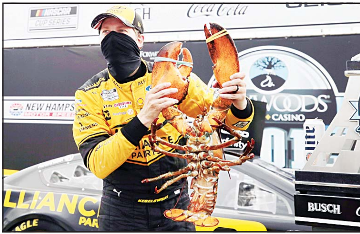
Driver Brad Keselowski holds a giant lobster to celebrate his victory in a NASCAR Cup Series auto race on Aug 2 at the New Hampshire Motor Speedway in Loudon, NH.

"About halfway down the backstretch I felt it go flat and tried to get slowed