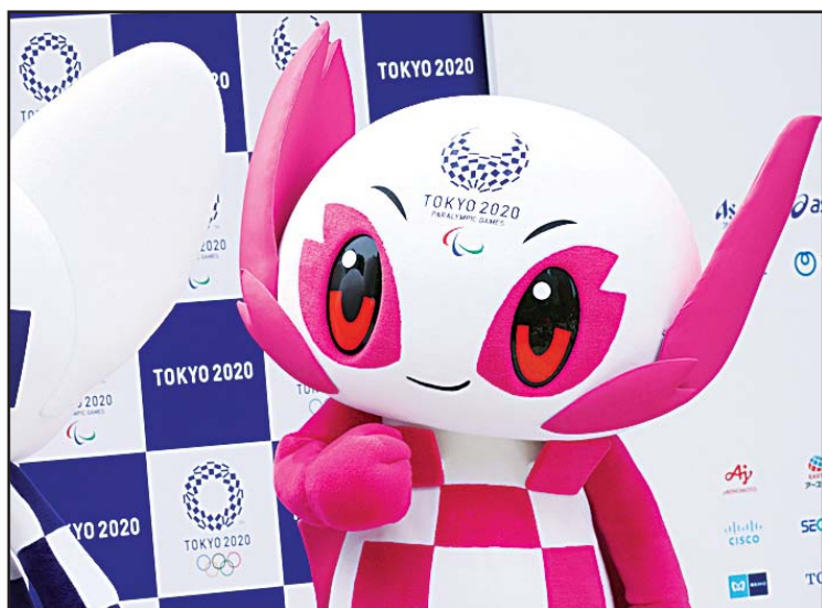
In this July 22, 2018 file photo, Tokyo 2020 Paralympic mascot 'Someity' stands on stage during their debut event in Tokyo.