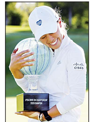
Danielle Kang hugs the LPGA Drive On Championship golf tournament trophy on Aug 2 at Inverness Golf Club in Toledo, Ohio.