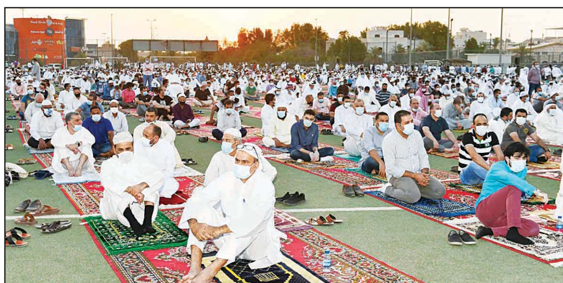
The sun rises as worshippers sit for Eid prayer on the first day of Eid Al-Adha.

The sources indicated that "The violation carried a suspicion of money laundering, as they violated provisions of the law regarding their activity books. The files will be referred to the Financial Investigation Unit concerning the observed violations, and the latter will open an extensive investigation on these violations from its side."