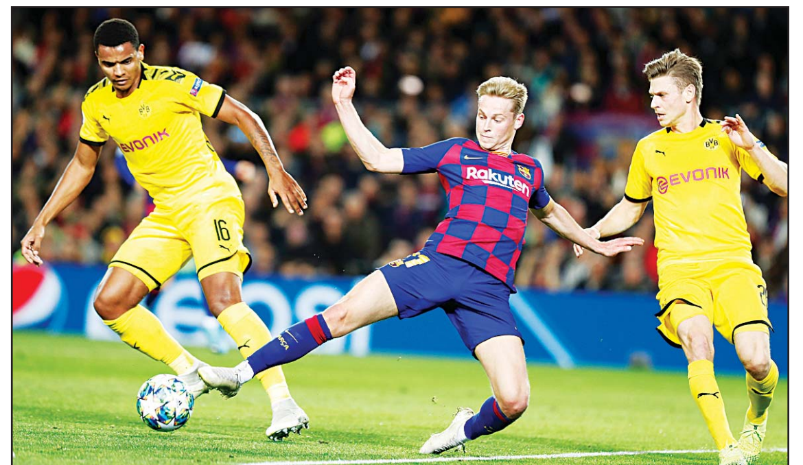
Barcelona's Frenkie de Jong (center), challenges for the ball with Dortmund's Manuel Akanji (left), during a Champions League Group F soccer match between Barcelona and Dortmund at the Camp Nou stadium in Barcelona, Spain on Nov 27.