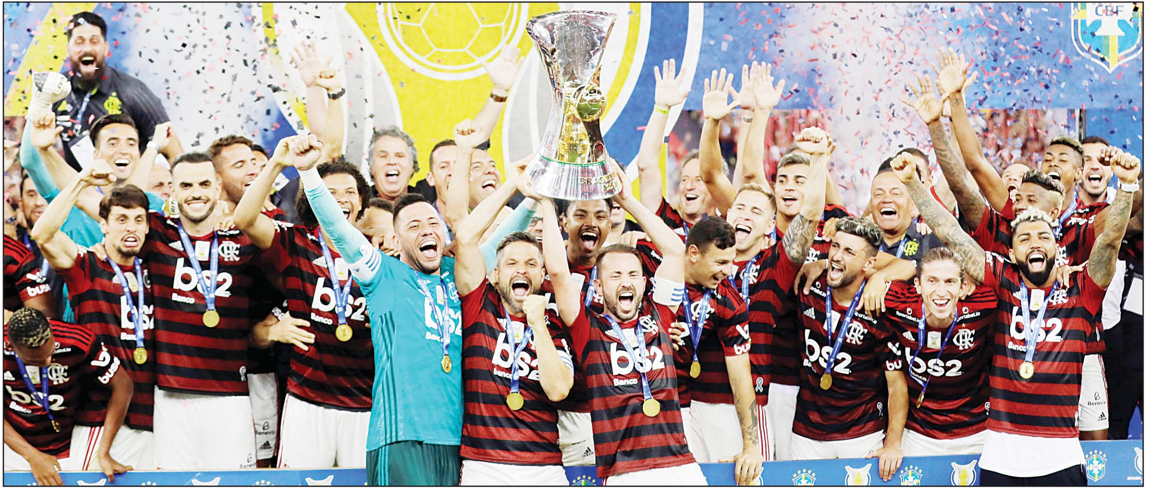
Flamengo's goalkeeper Diego Alves (center left), Diego Ribas and Everton Ribeiro lift up the trophy as they celebrate with teammates the Brazilian soccer championship at the end of a match against Ceara at the Maracana stadium in Rio de Janeiro, Brazil on Nov 27. Days after winning the Copa Libertadores championship, Flamengo won the national championship for the seventh time in its history.