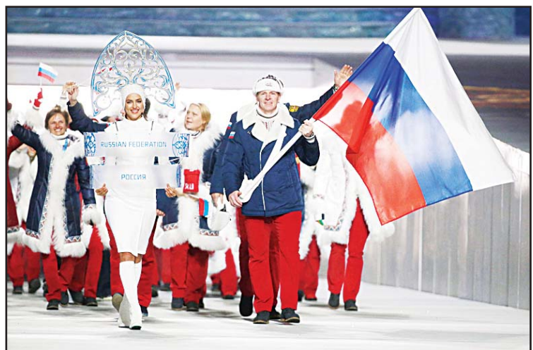
In this Feb 7, 2014 file photo Alexander Zubkov of Russia carries the national flag as he leads the team during the opening ceremony of the 2014 Winter Olympics in Sochi, Russia. At left is model Irina Shayk carrying the Russian placard.