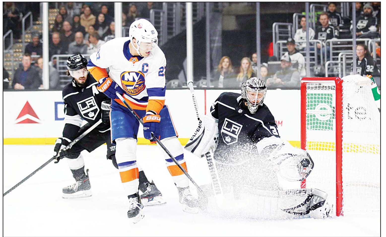
Los Angeles Kings goaltender Jonathan Quick (right), stops a shot next to New York Islanders' Anders Lee (27) during the first period of an NHL hockey game on Nov 27 in Los Angeles.