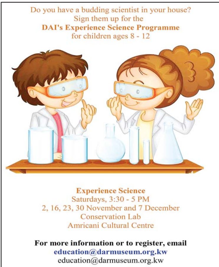
A flyer of the event