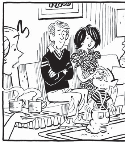
"MY MOM'S THE BOSS AROUND HERE TOO... 'CEPT SHE DOESN'T PAY US A DIME."

٨٣٣٣ Thamaniyat alaaq wa thalath maah wa thalath wa thalathoun