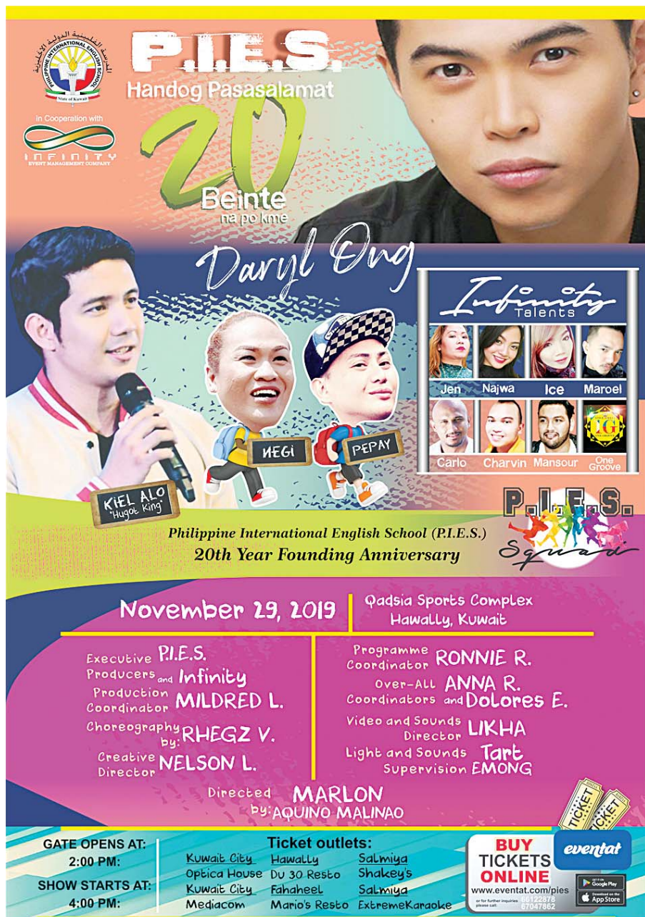
A flyer of the event

Please share with us your story or your memory during those old days by writing the