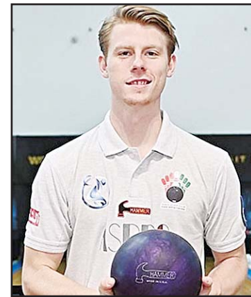
A player poses for a photo

For the first time in the history of the World Bowling Tour (WBT) series, one male and one female athlete from each of the three zones - Asian, European and Pan American - have been invited to take part in the WBT Finals alongside the top three male and female athletes from the 2019 WBT Rankings list.