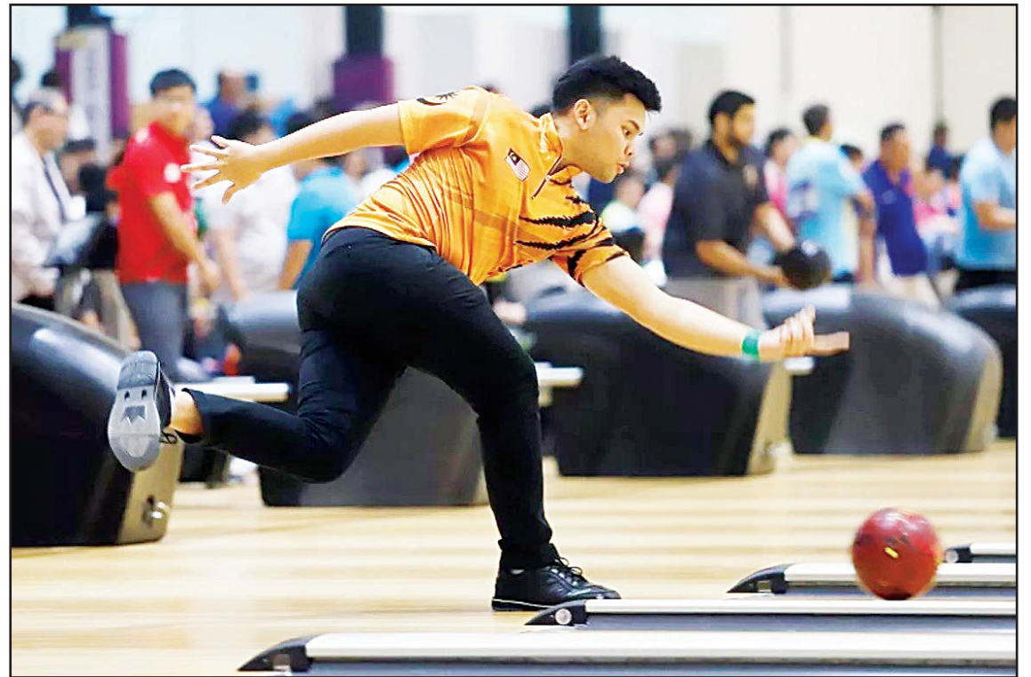
A player in action during the WBT-PBA 13th Kuwait International Open 2019.

Nike has since shut down the famed program, with its stable of elite competitors who added to the company's authority in the world of distance running, calling it a "distraction" for its athletes.