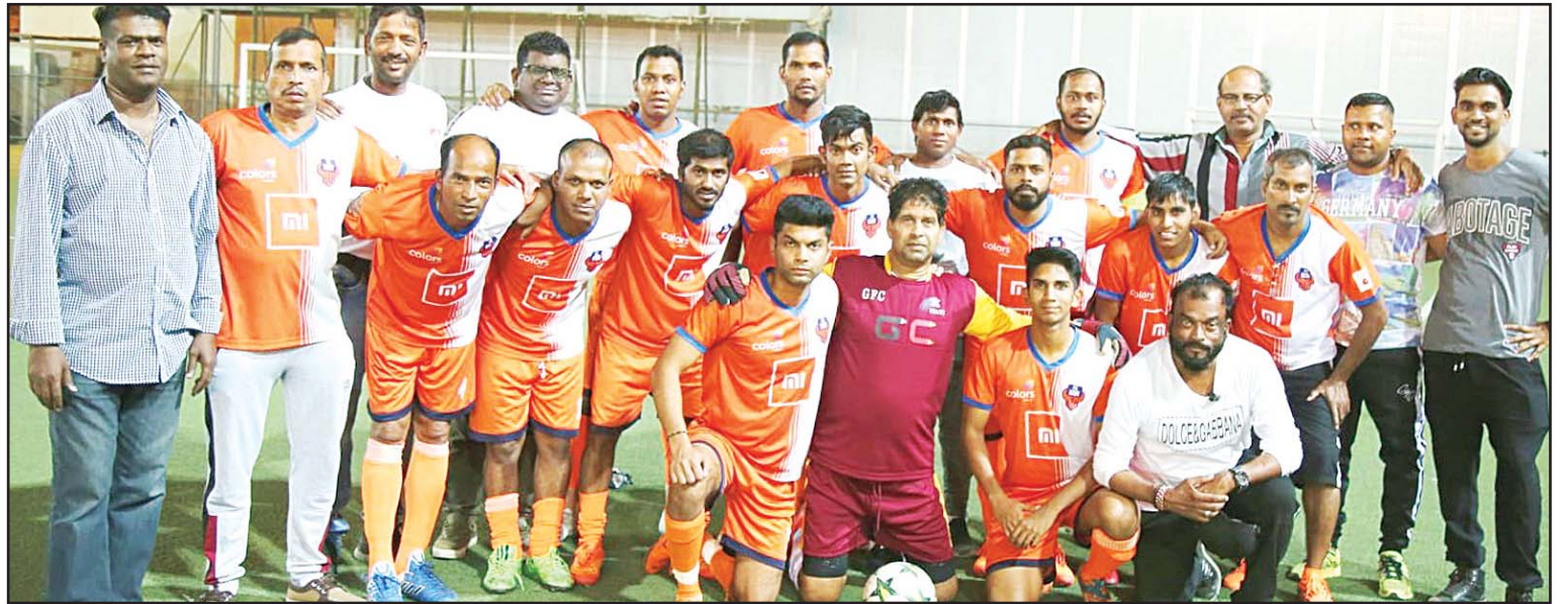
Finalists Pasha Boys with their management