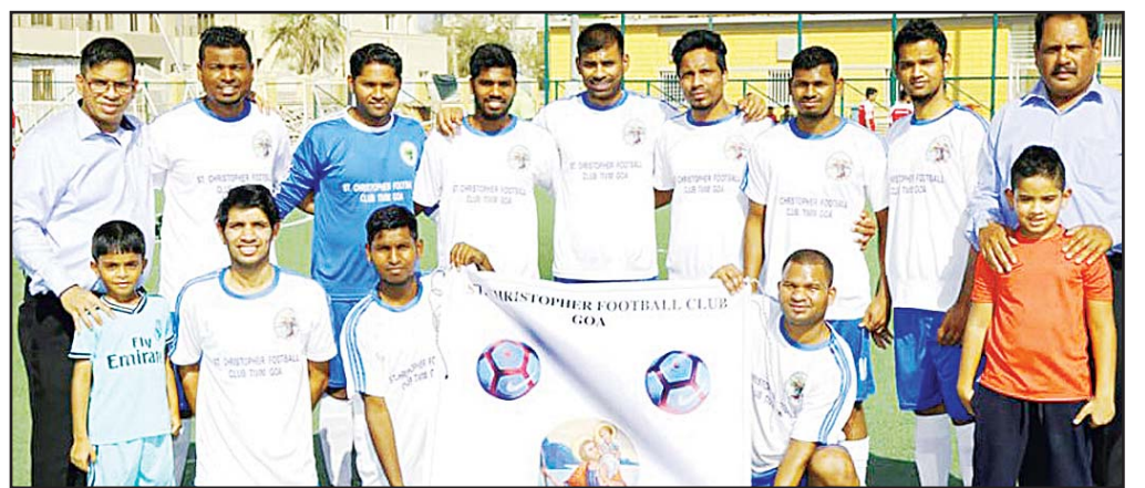
Finalists St Christopher