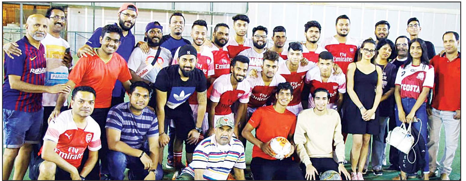
Losing semifinalists Amigos de Jardine, one of the best teams of the tournament