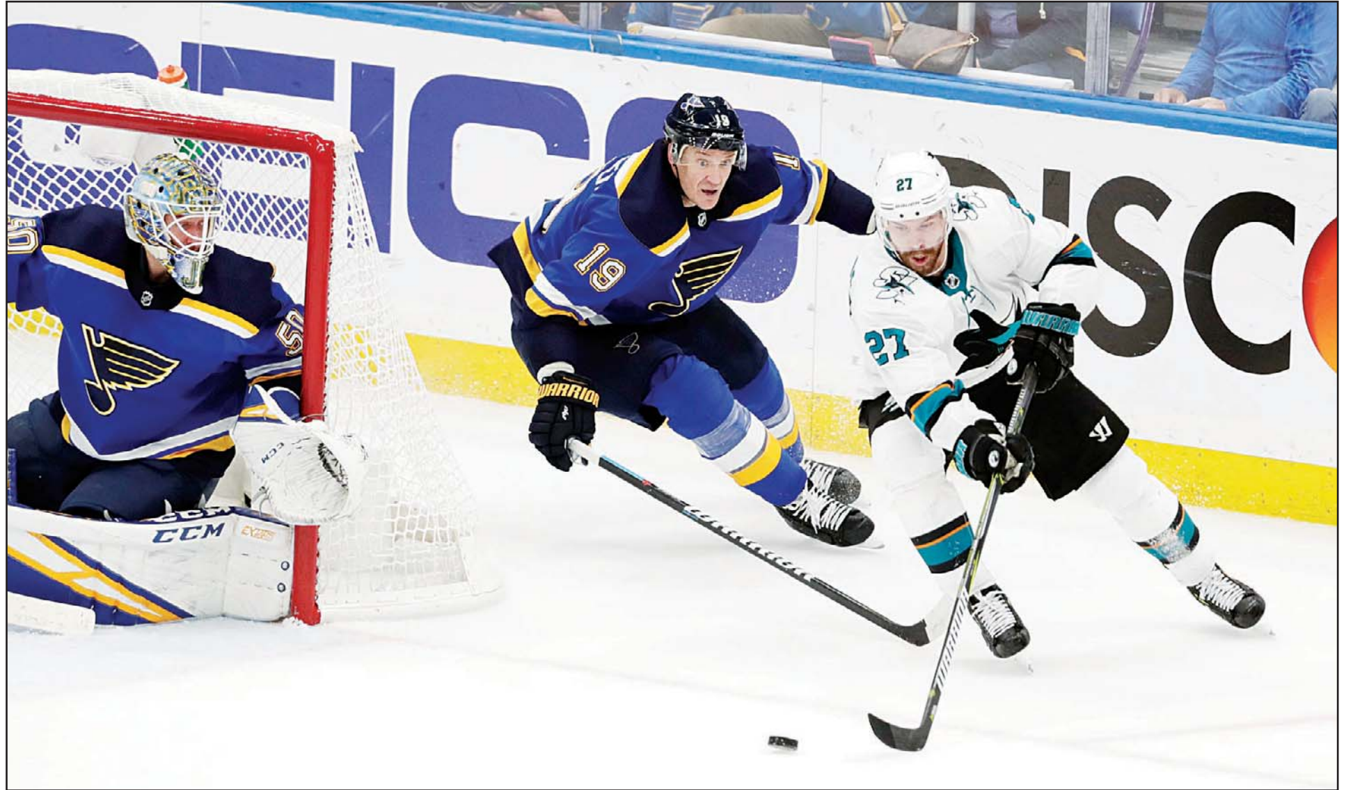
San Jose Sharks right wing Joonas Donskoi (27), of Finland, closes in on the nets St Louis Blues goaltender Jordan Binnington (50) and defenseman Jay Bouwmeester (19) follow during the second period in Game 6 of the NHL ice hockey Stanley Cup Western Conference Final series on May 21 in St Louis.

The Sharks, who are potentially facing major turnover before next season, were without a trio of key players. Forwards Joe Pavelski and Tomas Hertl were injured in Game 5, while defenseman Erik Karlsson was