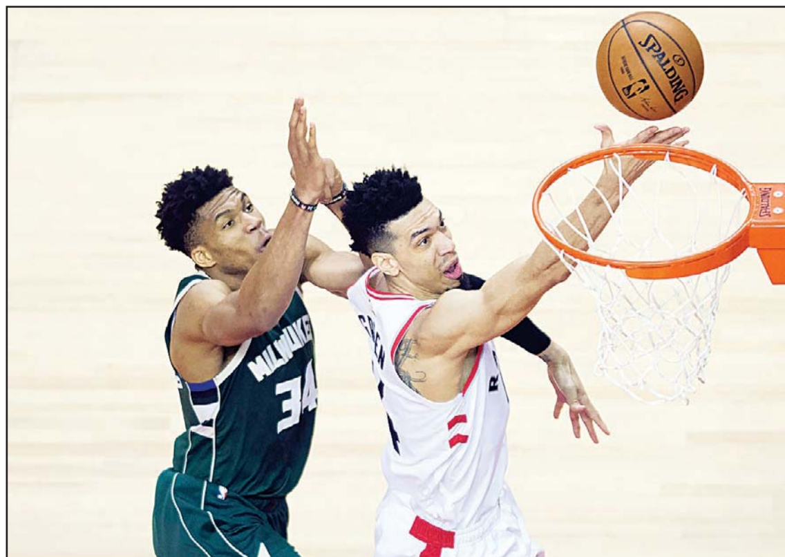
Toronto Raptors guard Danny Green (right), scores past Milwaukee Bucks forward Giannis Antetokounmpo (34) during the first half of Game 4 of the NBA basketball playoffs Eastern Conference Finals on May 21 in Toronto.