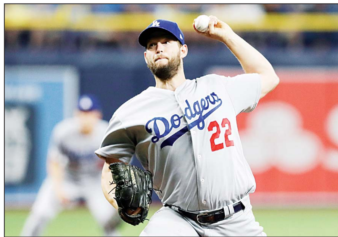
Los Angeles Dodgers starting pitcher Clayton Kershaw delivers to the Tampa Bay Rays during the first inning of a baseball game on May 21 in St Petersburg, Florida.

Detroit forced extra innings by scoring two unearned runs off Miami closer Sergio Romo. The bottom of the ninth included an error, two replay re-