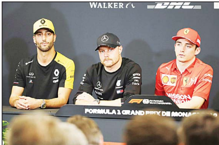
From left, Renault driver Daniel Ricciardo of Australia, Mercedes driver Valtteri Bottas of Finland and Ferrari driver Charles Leclerc of Monaco attend a news conference at the Monaco racetrack, in Monaco, on May 22.

Red Bull won last year from pole position with Daniel Ricciardo, but the Australian has moved to Renault and Max Verstappen is the main hope now.