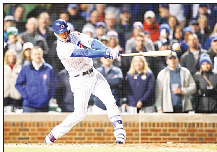
Chicago Cubs' Javier Baez hits a game winning RBI-single against the Philadelphia Phillies during the ninth inning of a baseball game on May 21 in Chicago.

"The Red Bull was a great car but I always feel like Monaco is a track where, if you're comfortable with the circuit and the walls and all that and have the confidence, you can leapfrog maybe your car's position further up.