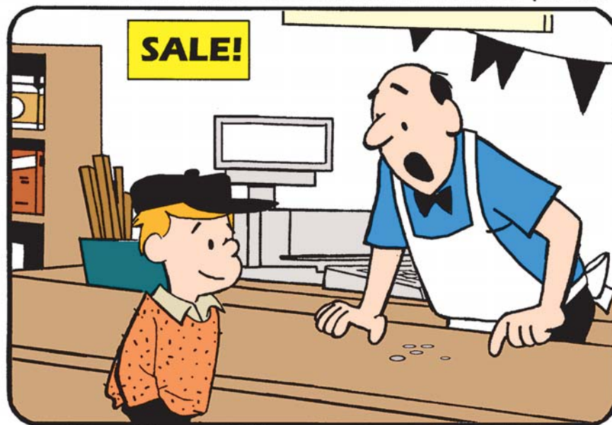
Differences: 1. Arm is moved. 2. Cap is different. 3. Ear is smaller. 4. Apron is different. 5. Collar is different. 6. Mouth is different.