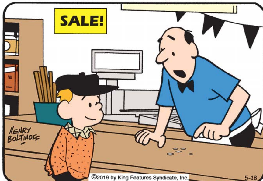
Find at least six differences in details between panels.

Islamic classes in French: The Enlightenment into Islam is offering Islamic Classes in French for ladies. Timings 4:30 to 7 pm. Every Wednesday. Please register at the office (Women's Section), 2nd floor. For more information please contact us. Telephone 25362684, 99788954, 99507079, 97743327. Fax 25342573 (attention — Enlightenment into Islam)