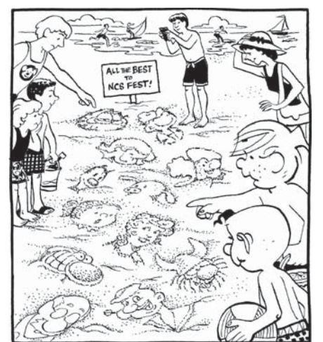
"WHOEVER DID THIS SHOULDN'T BE WASTIN' ALL THEIR TALENT DRAWIN' IN THE SAND!"

٨١٧٣ Thamaniyat alaaaf wa ma'ah wa thalath wa saboun