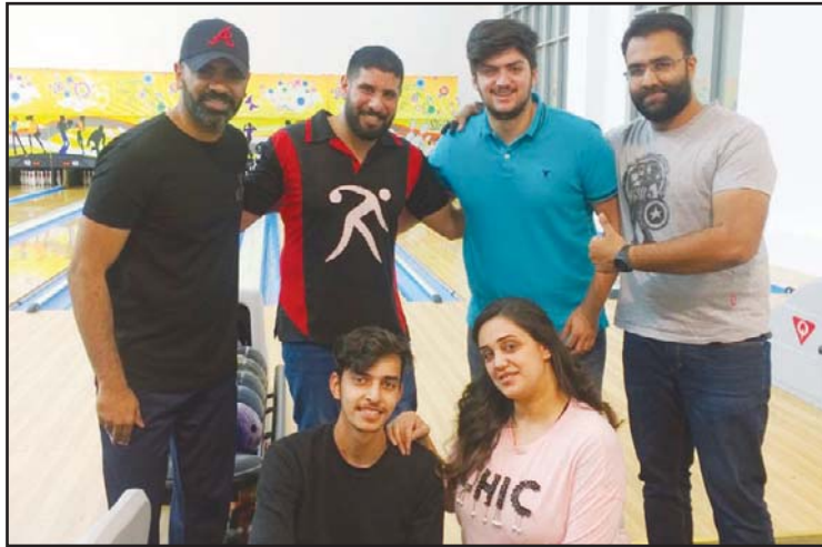
Jordan Elite Bowlers