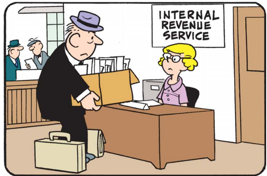
Differences: 1. Box is smaller. 2. Nose is smaller. 3. Window on door is smaller. 4. Briefcase is moved. 5. Jacket is longer. 6. Bottom of desk is different.