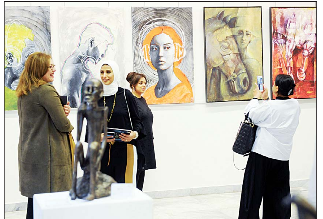
The 'Egyptian Vision' exhibition which displays fine arts of Egyptians residing in Kuwait in progress.