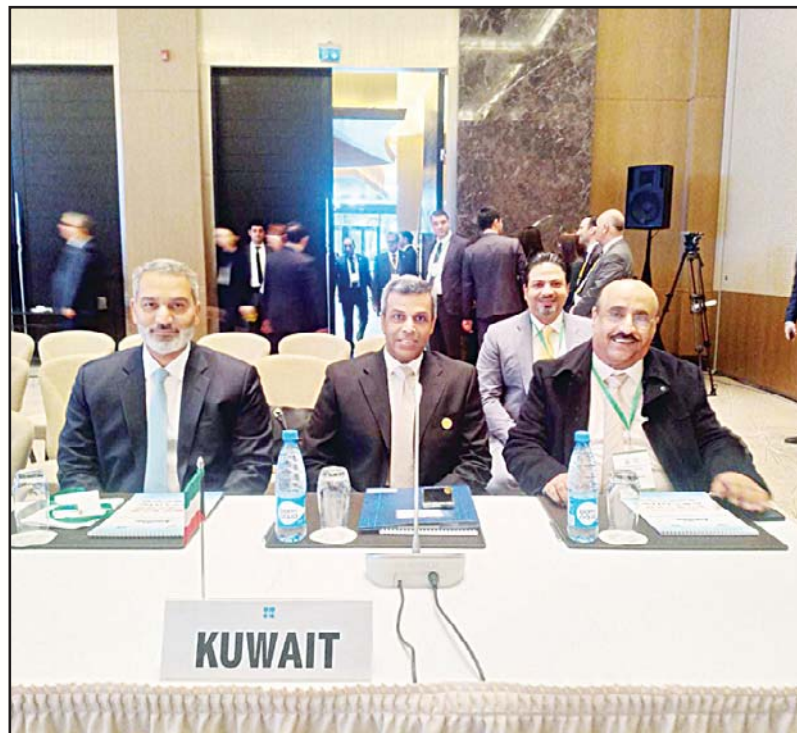
Kuwait's Oil Minister Khaled Al-Fadhel participates in the 13th ministerial meeting of the joint monitoring committee of OPEC and non-OPEC members in Azerbaijan's capital, Baku.

Meanwhile, the Kuwaiti minister met with his Nicaraguan counterpart Ivan Acosta, discussing with him ways of bolstering investment and financial cooperation.