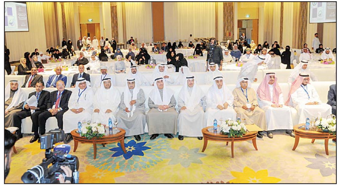
First Kuwait International Academic Conference on Educational Administration and Planning in Progress.