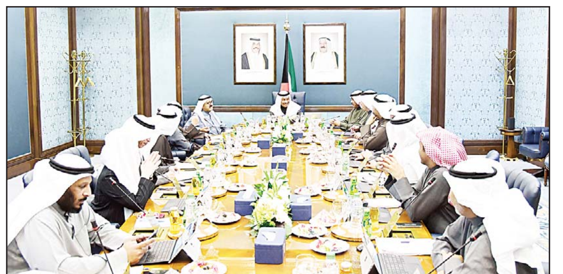
Photo from PM's Diwan HH the Prime Minister Sheikh Jaber Mubarak Al-Sabah chairs the weekly Cabinet meeting.

Kuwaiti Cabinet expressed its condemnation of the shooting incident that took place this morning at a tram station in the city of Utrecht in The Netherlands, which resulted in the death of three people and injury of some five others. The Cabinet stressed Kuwait position, which rejects these criminal acts that has claimed the lives of innocent people in violation of all humanitarian laws, norms and values.