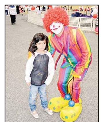
Above: Some photos from the 'Carnival of HOPE'.