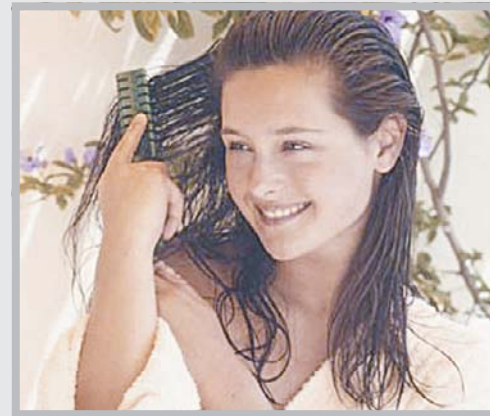
hair brush hygiene

It is easy to forget to keep your brushes clean, when you are rushing about every day. Wash any brushes and combs at least once a week in warm water to which a little shampoo is added. You can also dissolve a tablespoon of bicarb in warm water, add a little liquid antiseptic and shake rapidly for a minute or two.