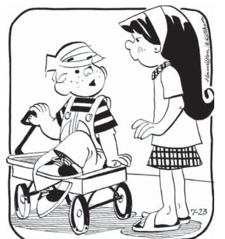
OF COURSE I WANT TO BE GOOD ALL THE TIME... IT'S JUST A LOT OF TIME TO BE GOOD!