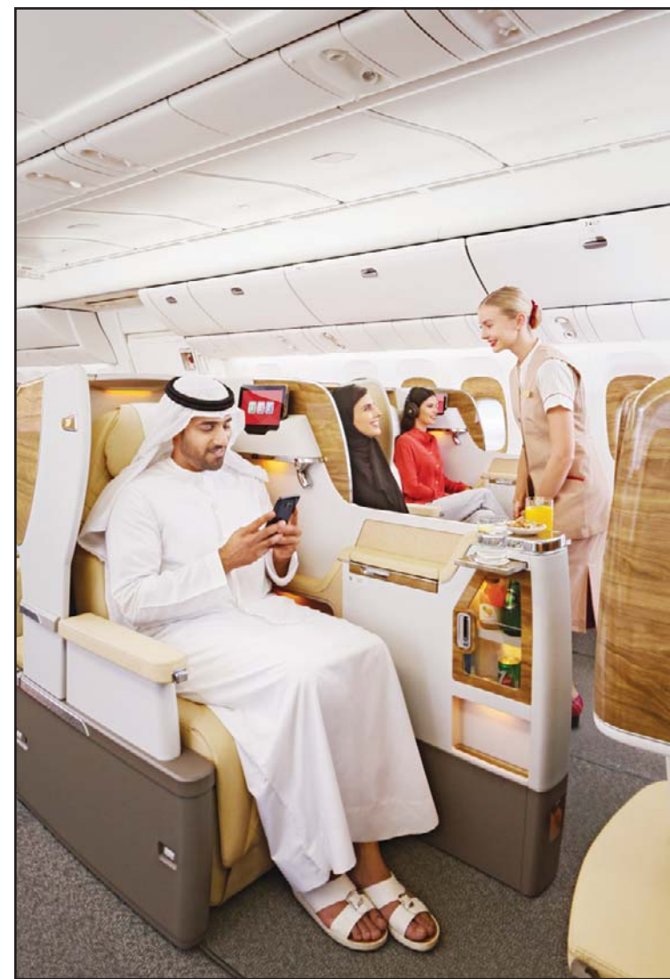
Experience Emirates' award-winning Business Class to select destinations and upgrade to Emirates Skywards Gold.

Even if you're running graphically-intensive games at high settings, this device stays cool and does not stutter thanks to the integra-