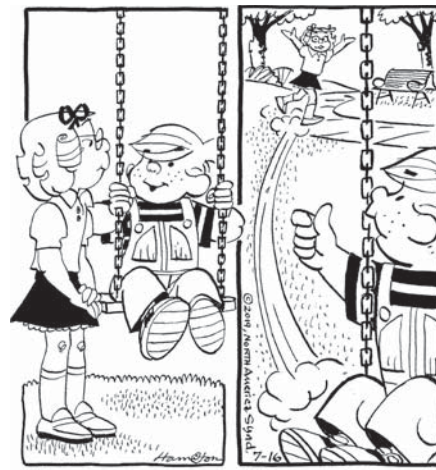
"I'LL RACE YOU TO THE OTHER SIDE OF THE PLAYGROUND!" "HOORAY! YOU WON! SEE YA TOMORROW!"

Thamaniyat alaaf wa meatan wa thamaniyat ashar