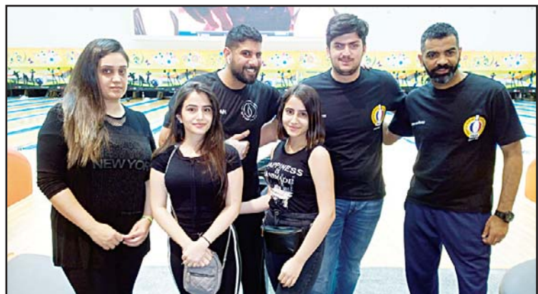
Jordan Elite Bowlers