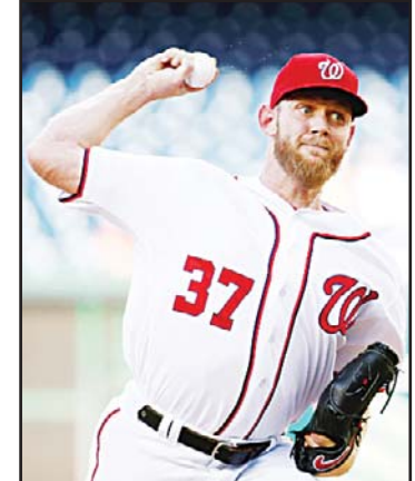
Washington Nationals starting pitcher Stephen Strasburg throws to the Miami Marlins in the first inning of a baseball game on July 3 in Washington.