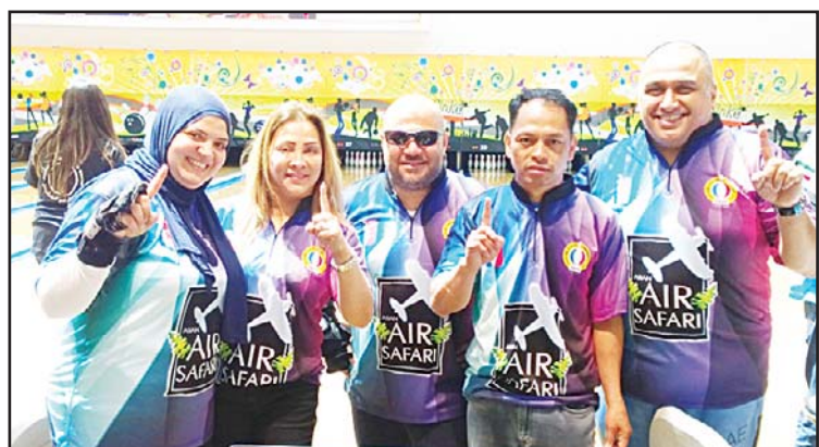
Asian Air Safari