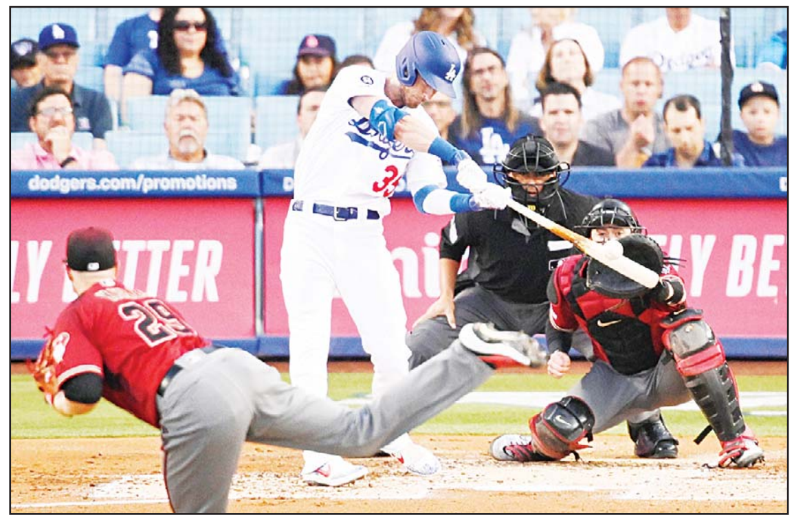
Los Angeles Dodgers' Cody Bellinger hits a solo home run off Arizona Diamondbacks starting pitcher Merrill Kelly (foreground), during the second inning of a baseball game on July 3 in Los Angeles.