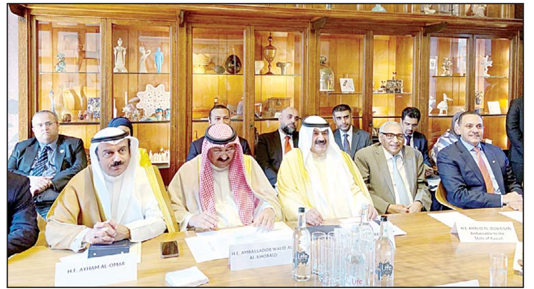
Kuwait delegation during the 14th session of the Kuwait-British Joint Steering Group.

He saw that it was uneasy to take all the proposals, although flexibility in adapting some pro-