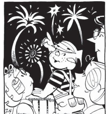
“I KNOW YOU SHOULDN'T PLAY WITH MATCHES... BUT HOW ELSE WERE FIREWORKS INVENTED?”

٨٢٠٨ Thamaniyat alaaaf wa meatan wa thamaniya