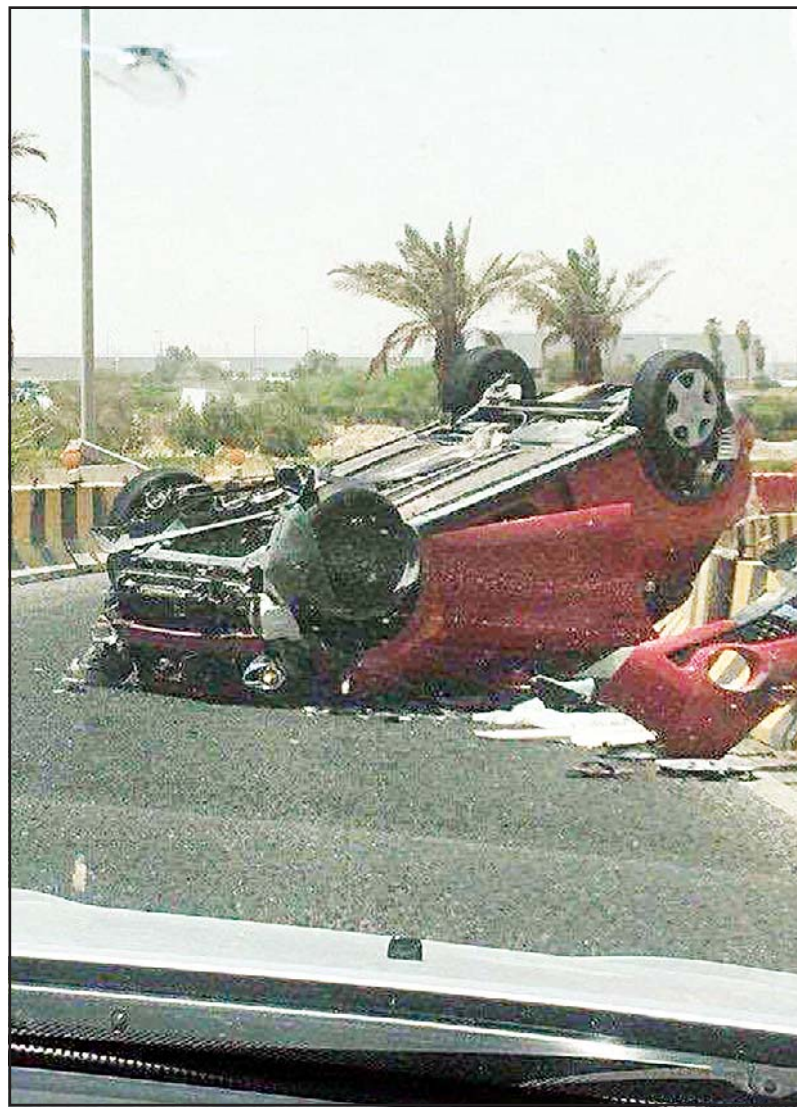
The toppled car of the woman.

ties to update their mobile numbers, as they may receive a text message about the issuance of new permanent certificates if they are eligible, even though their existing certificates are valid, and they will have to receive the certificates from any branches of the authority after receiving the text message.