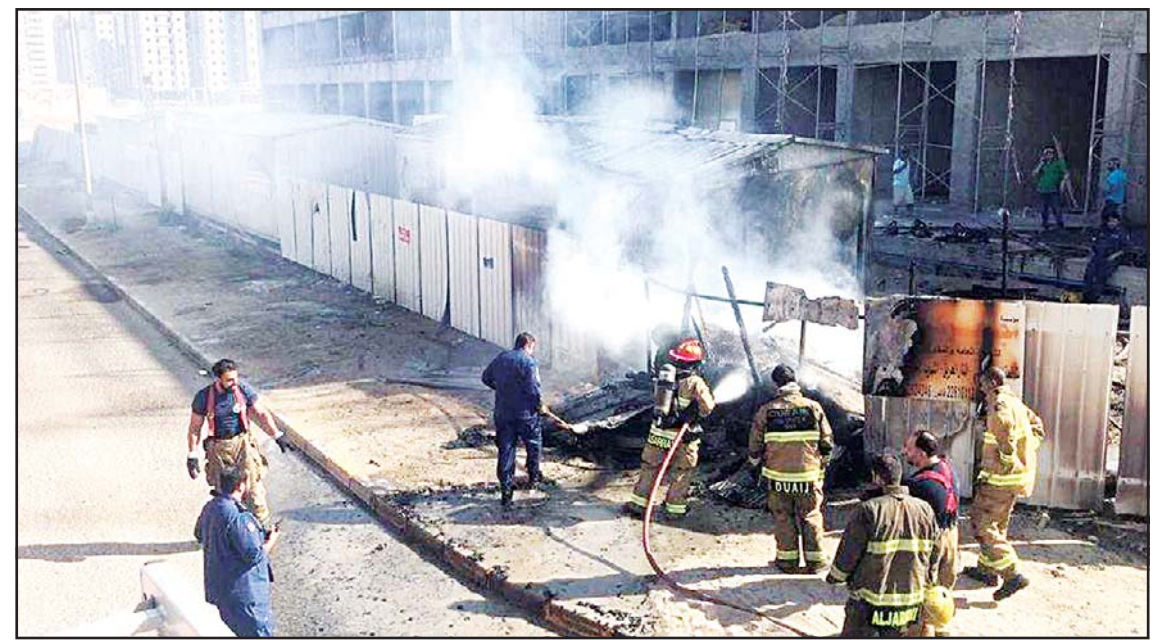
Firemen putting out the blaze to the chalets.

Egyptians held for fighting: Two unidentified Egyptians who were seen throwing punches at each other and exchanging insults have been arrested and detained at a police station in Hawalli, reports Al-Rai daily.