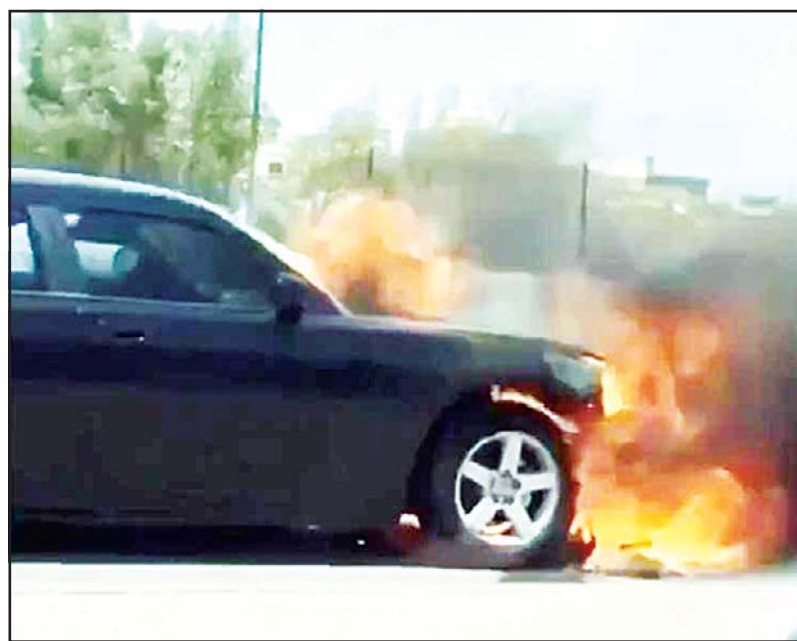
The vehicle on fire on Fahaheel road.

of Interior received information about the accident, securitymen, paramedics and firefighters rushed to the location and discovered that the woman was trapped inside her vehicle. They pulled her out of the vehicle, and paramedics referred her to Mubarak Hospital for treatment.