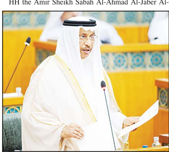
HH the Prime Minister Sheikh Jaber Mubarak Al-Hamad Al-Sabah.

KUWAIT CITY, July 3: In one of the last matters of business for the third round of the 15th legislative term, the National Assembly renewed its confidence in Finance Minister Nayef Al-Hajraf as 32 MPs voting against the no-confidence motion while 16 voted in favor.