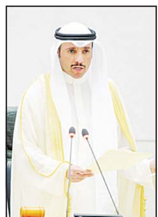
Speaker of Parliament Marzouq Al-Ghanim delivering his speech.