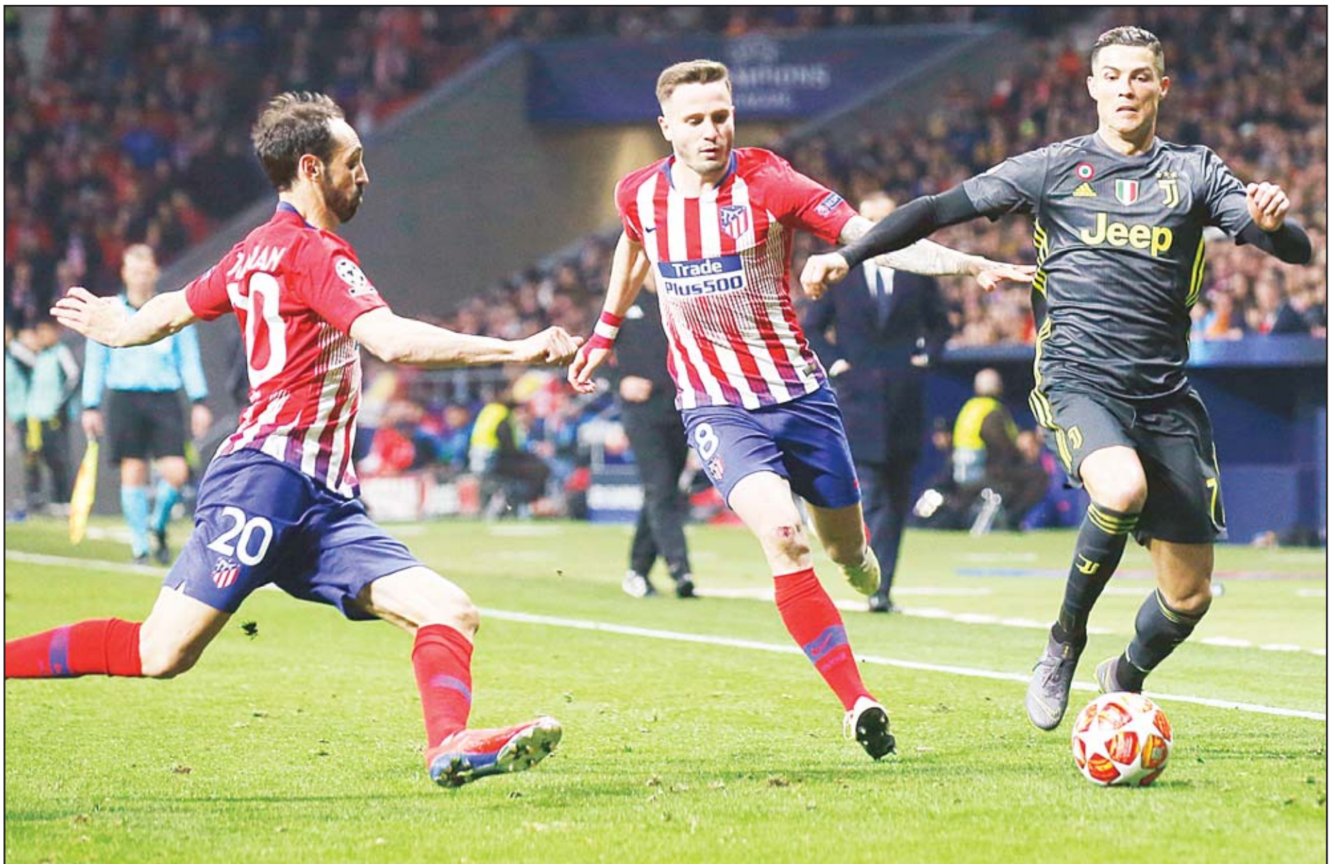
Atletico defender Juanfran and Atletico midfielder Saul Niguez fight for the ball against Juventus forward Cristiano Ronaldo during the Champions League Round of 16 first leg soccer match between Atletico Madrid and Juventus at Wanda Metropolitano stadium in Madrid on Feb 20.

Juventus forward Mario Mandzukic (right), heads the ball as Atletico defender Diego Godin (center), defends during the Champions League, Round of 16 first leg soccer match between Atletico Madrid and Juventus at Wanda Metropolitano stadium in Madrid on Feb 20.