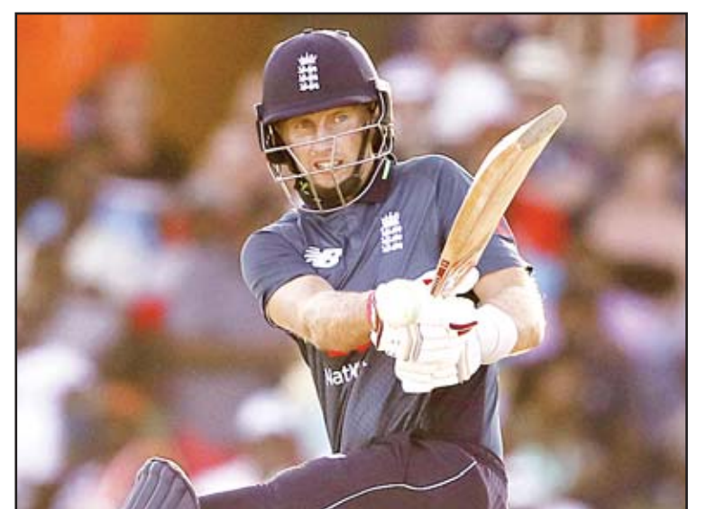
England's Joe Root plays a shot against West Indies during the first One Day International cricket match at the Kensington Oval in Bridgetown, Barbados on Feb 20.

WEST INDIES C. Gayle b Stokes..... 135 J. Campbell c Ali b Woakes..... 30 S. Hope c Rashid b Stokes..... 64 S. Hetmyer c Roy b Woakes..... 20 N. Pooran c Roy b Rashid..... 40 D. Bravo c Woakes b Rashid..... 0 J. Holder st Buttler b Rashid..... 16 C. Brathwaite c Buttler b Stokes..... 3 A. Nurse not out..... 25 D. Bishoo not out..... 9 Extras: (1lb, 1lb, 1nb, 15w)..... 9 Total: (8 wks, 50 overs)..... 360 Fall of Wickets: 1-38 (Campbell), 2-169 (Hope), 3-229 (Hetmyer), 4-230 (Pooran), 5-294 (Bravo), 6-317 (Gayle), 7-322 (Holder), 8-343 (Brathwaite) Did not bat: Thomas Bowling: Woakes 10-0-59-2, Wood 7-0-49-0, Ali 10-0-85-0, Plunkett 6-0-