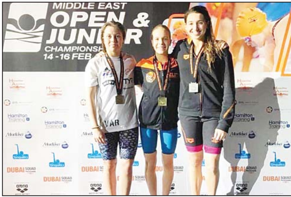
Kuwait's elite swimming team won third place in the Middle East International Swimming Championship, bagging 30 medals - 17 gold, 7 silver and 6 bronze – as well as breaking the championship's record in various age group competitions. According to a press release, the just-concluded championship was held in Dubai, the United Arab Emirates, and is considered one of the toughest championships in the Middle East. More than 1,000 swimmers from 62 teams around the world participated in the championship.

The organisers said they wanted to deliver a Games that were "in keeping with the times and inspire new audiences and attract young people ... and which can be played