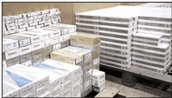
Cigarettes for auction.

3- Educating and Supporting Parental control: Zain is an advocate for internet safety and is putting more importance in 2019 behind the education and awareness of cyberbullying for Kids. More so reaching out to Parents and the wider society to understand the dangers inappropriate content and how we can better keep our families and children safe.